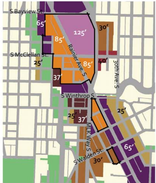
Recommended Height Limits