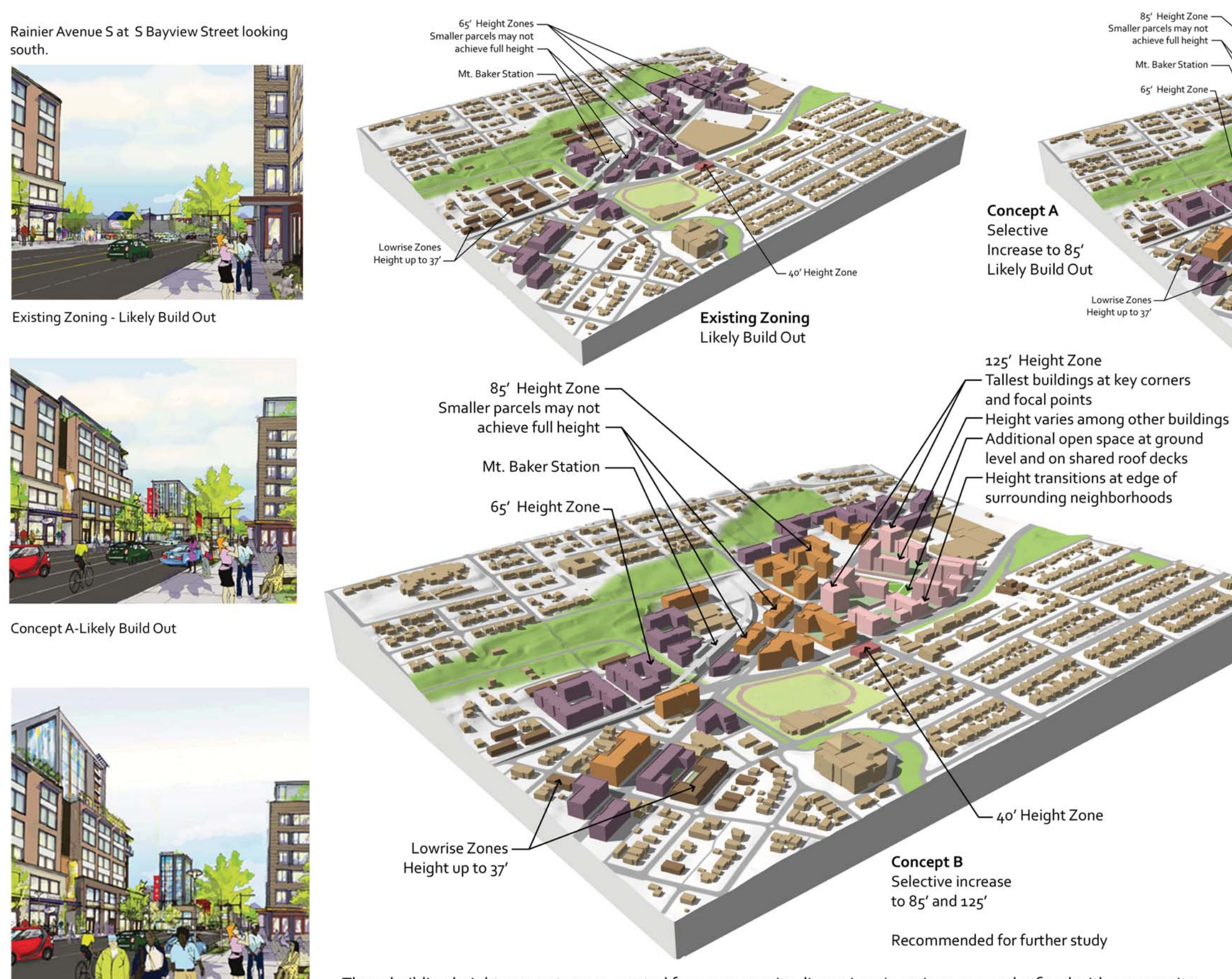
Concept B-Likely Build Out Recommended for Further Study

These building height concepts were created from community discussions in spring 2009 and refined with community review from meetings that summer and fall. Using tools such as urban design framework plans, neighborhood design guidelines, zoning, and street design plans, the community will further define the desired form and characteristics of this Town Center to achieve the goals and vision of their neighborhood plan. See appendix for additional land use recommendations.