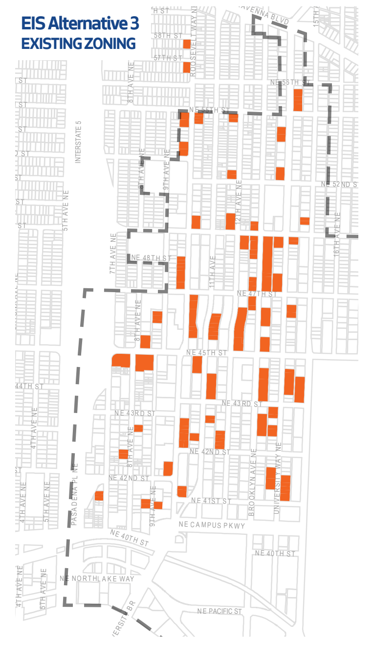
This shows redevelopment under existing zoning. 3,900 units, spread across the planning area, would result in the demolition of about 60 homes.

number of 1,500 homes, the report combines households experiencing direct and economic displacement, ignoring the fact that rents are increasing in all buildings in the U District, with or without zoning changes. This greatly exaggerates the potential displacement that could occur as a result of the proposed zoning changes. Second, this number does not reflect a defined period of time. Obviously, over an indefinite time period, all housing becomes susceptible to redevelopment. Third, this number derives from a speculative survey of buildings that appear to be more than 15 years old, incorrectly inferring that all of their units are affordable with no