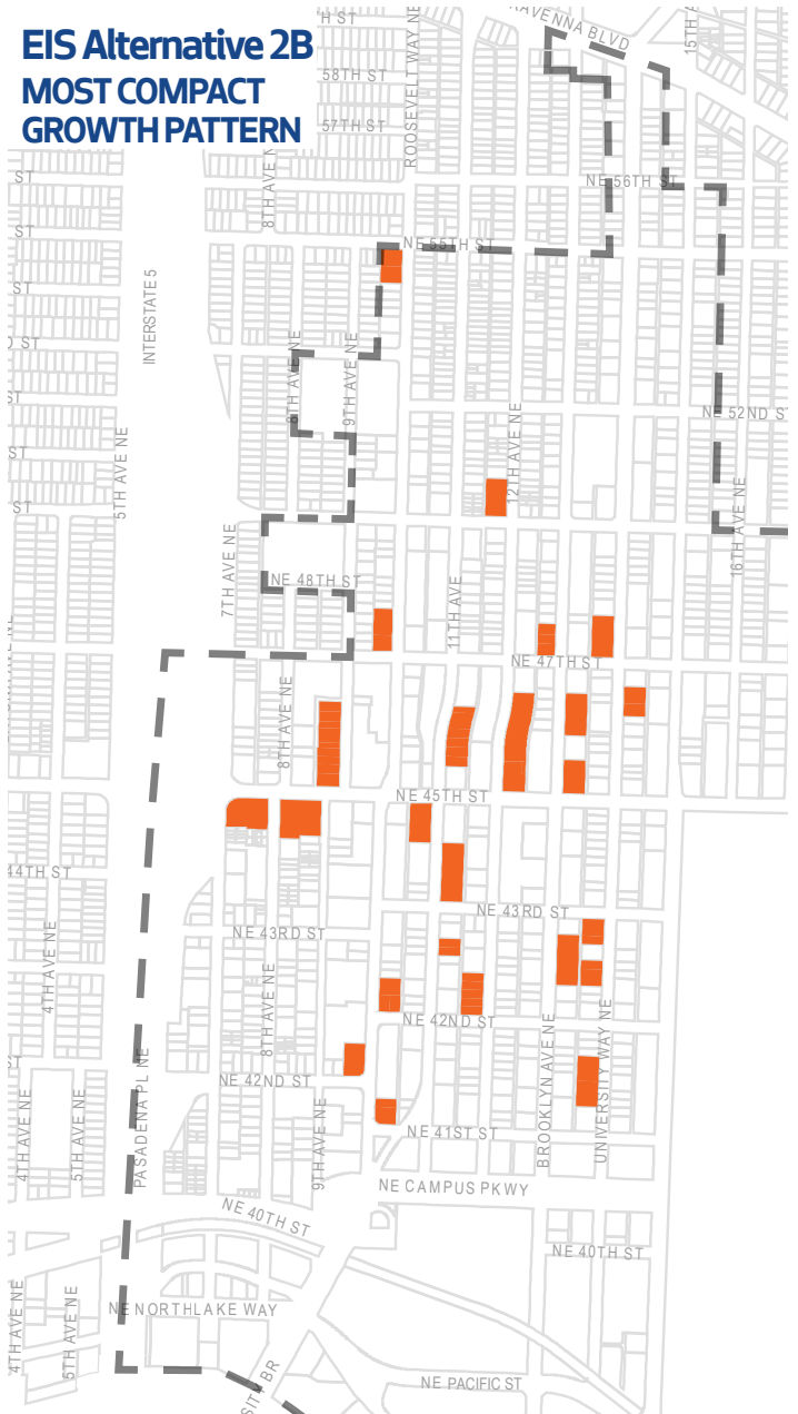
Alternative 2B from the EIS is the densest, most compact growth pattern. 5,000 new units would result in demolition of about 40 homes.