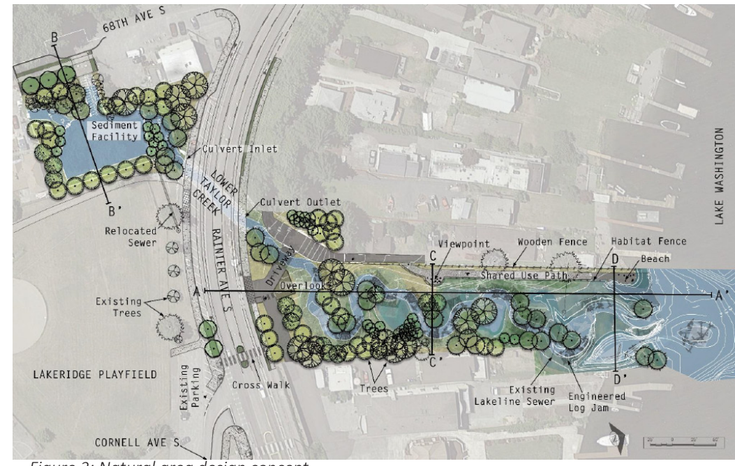
Figure 2: Natural area design concept

of Transportation (SDOT) and Seattle Parks and Recreation (SPR) to address corridor safety improvements and for the long-term ownerships and maintenance of the natural area.