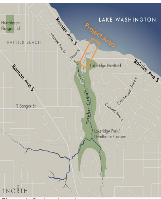
Figure 1: Project location

Jason Sharpley, of Seattle Public Utilities (SPU), and Danielle Devier, of Natural Systems Design, presented the concept design for the Taylor Creek Culvert Replacement project. The project is located near Lake Washington in southeast Seattle. Several major storm events have caused major sediment issues, which have negatively affected the creek habitat and surrounding private property. Project goals include creek habitat restoration, improved fish passage, and reduction of soil erosion near Lake Washington. The design proposal includes a sediment retention facility, culvert replacement beneath Rainier Ave S, corridor safety improvements along Rainier Ave S, and an accessible nature area between Rainier Ave S and Lake Washington. SPU is partnering with Seattle Department