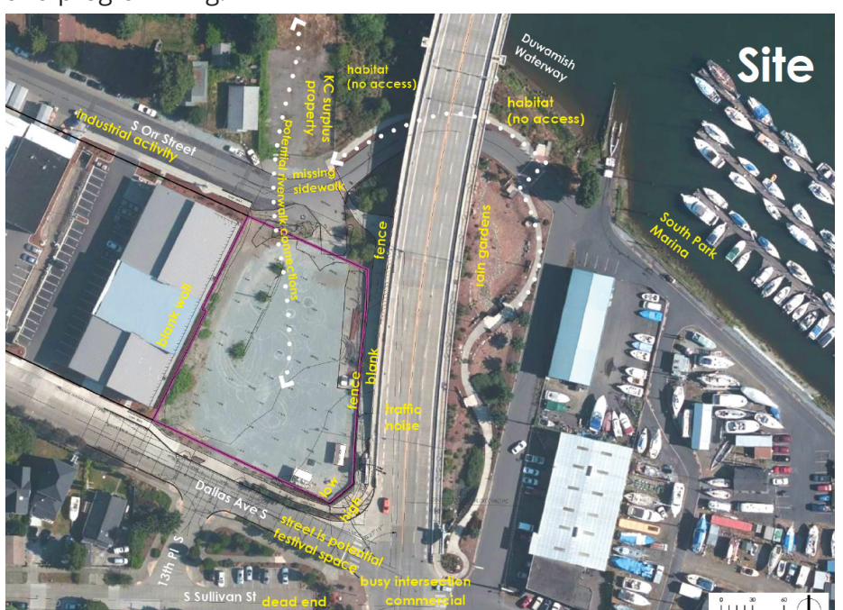
Figure 1: Project location

The project team then discussed how they are continuing to coordinate with the community, local non-profits, and city departments to develop programming opportunities that are culturally relevant and important to the community. The team also expressed their intent to continue conversations about ways to incorporate art and cultural elements within the plaza design and programming.