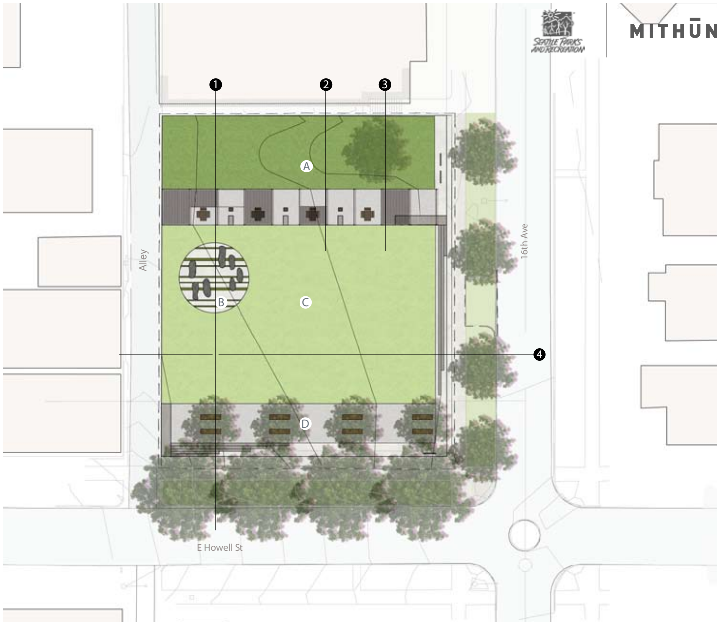
(A) Collective Garden (B) "Seven hills of Seattle" (C) The green (D) Shannon's Allee (proposed name for consideration)