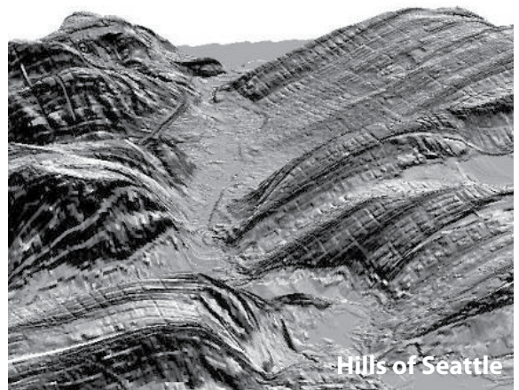
Hills of Seattle