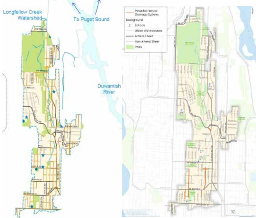
Figure 1: Longfellow Creek Watershed Figure 2: Project site locations

The project team then described efforts to minimize disruptions of the Delridge and West Seattle neighborhoods. SPU has facilitated this project through an equity plan toolkit and hopes to focus on underserved communities. Outreach strategies included a stakeholder analysis, resident surveys, ranking criteria through race and social justice, local drop-in informational sessions, and doorto-door follow-up.