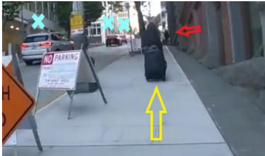
NE#3’s BWV - CM#2 Heading Eastbound (EB) Looking Back at NE#3 Westbound (WB) and Moving Towards Witness (red arrow)

On July 18, 2023, SPD officers, NE#1, NE#2, and NE#3 responded to an alleged unprovoked stabbing of CM#1 by the suspect CM#2 in downtown Seattle. The stabbing occurred near Second Avenue and Cherry Street. The initial call classification from dispatch was for an Assault 1 in-person, with or without weapons with a Priority Remark of a 4-inch knife. Remarks: Victim Stabbed. Dispatch updated that one witness was following CM#2 and described CM#2 as, “WM, 40S, 5’8, Beard, BLK JKT, BLU Jeans”. CM#2 was last seen walking west on Columbia Street. NE#3, a Canine officer, located CM#2 first at 1 st Avenue and Spring Street. CM#2 was walking eastbound and had a suitcase. NE#3 provided this information to Radio. NE#1 and NE#2 were a patrol unit that was nearby and proceeded to this location. NE#1 was the driver and NE#2 was seated in the front passenger seat. NE#3 was the first officer to locate CM#2 and indicated, “And I got him, it’s going to be First and Spring. He’s got a suitcase with him.” NE#1 asked over the air what side of the street CM#2 was on. NE#3 responded, “He’s going to be on the eastside of the street. He’s not stopping for me. (Sounds like), I’m going to wait for another unit.” NE#3 exited her vehicle and CM#2 faced her and yelled something (inaudible). NE#3 stated, “Get on the ground. Get on the ground.” CM#2 did not comply and turned and moved eastbound, uphill on Spring Street, pulling a suitcase on wheels behind him.