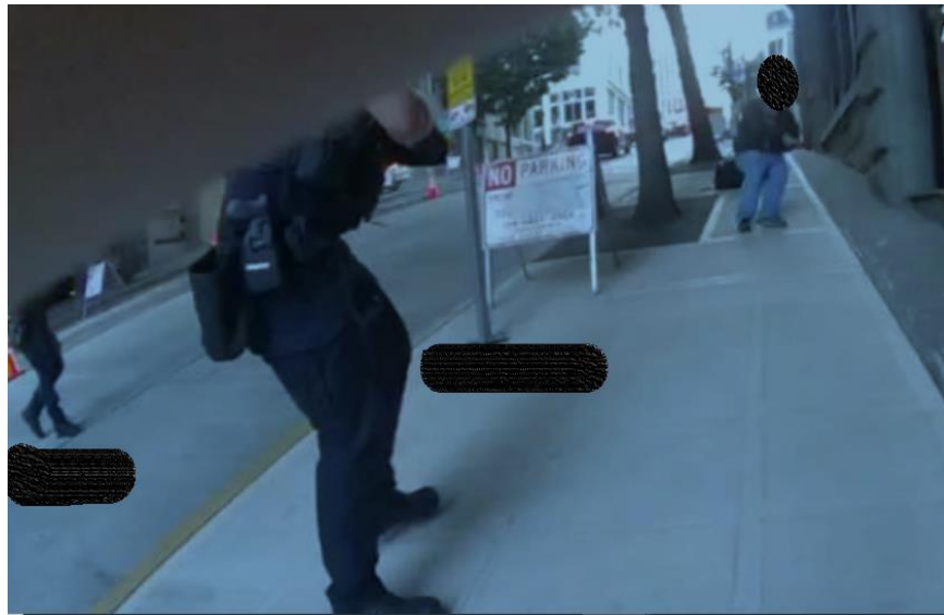
NE#3's BWV – Capturing NE#1's Position of NE#1, NE#2 and CM#2 at the time of Shooting. NE#1 is at an angle on the street Shooting EB at CM#2 and NE#2 is WB on the sidewalk

NE#1 then fired two shots at CM#2 from an angled position from the street while CM#2 was brandishing a knife. CM#2 fell to the ground.