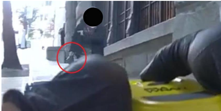
NE#2's BWV – deploying BolaWrap Eastbound. CM#2 Walking Toward NE#2 and NE#3 WB.

NE#2 held his BolaWrap device up and aimed it at CM#2 and stated, "Get on the ground or you're going to get wrapped!" NE#2 tried to deploy the BolaWrap that made a loud noise; however, the deployment was not successful. 2 CM#2 continued to move quickly towards NE#2 and NE#3 with a knife in his right hand. NE#3 drew her firearm and aimed it at CM#2.