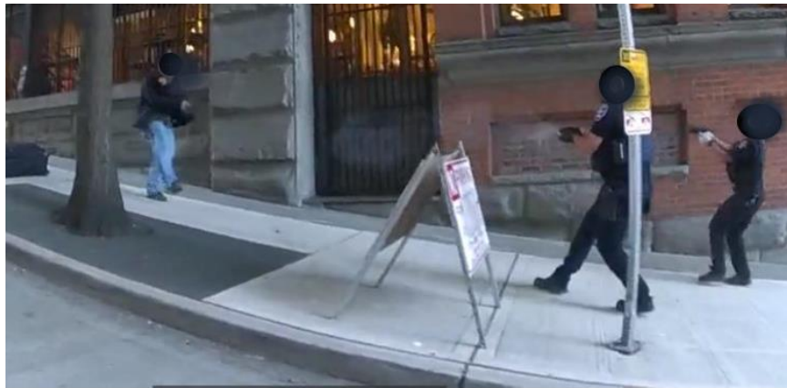
NE#1's BWV – CM#2 (EB) Moving Toward NE#2 (on the left WB) and NE#3 on the right WB)

NE#1 then fired two shots at CM#2 from an angled position from the street while CM#2 was brandishing a knife. CM#2 fell to the ground.