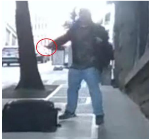
NE#3's BWV - CM#2 looking WB with Knife in Right Hand Circled in Red

He's got a knife! He's got a knife!" NE#3 stepped back and CM#2 is yelled (in audible) going towards NE#2 and NE#3 on the sidewalk.