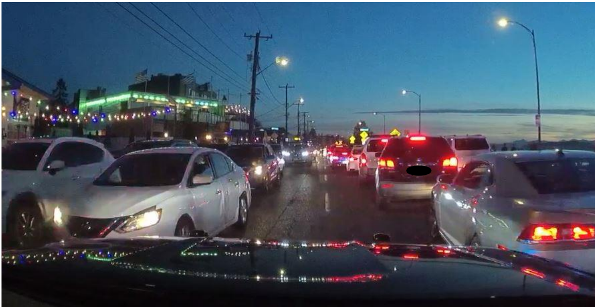
Still image from NE#1's ICV depicting traffic conditions as NE#1 began driving between the opposing rows of traffic.

As he continued to advance, NE#1 used his public address system (PA System). NE#1 broadcast over his PA System: