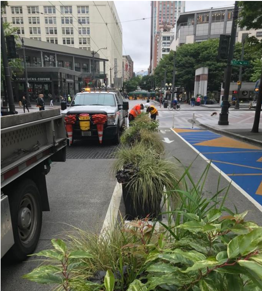
SDOT workers replace planters near Westlake Park.