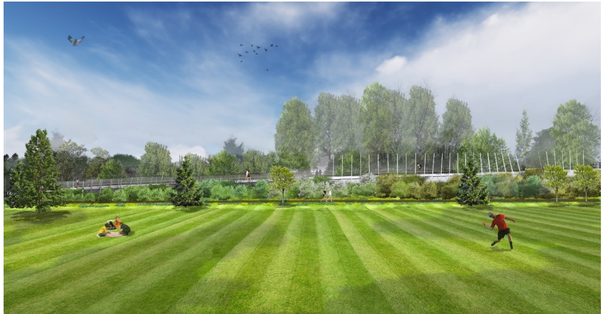
Artist Rendering; Pedestrian Sky Bridge North Campus

NSC has not implemented this program element due to lack of funding. Bus route #26 provides a connection to the campus and the Pedestrian Skybridge will meet this need Fall of 2021.