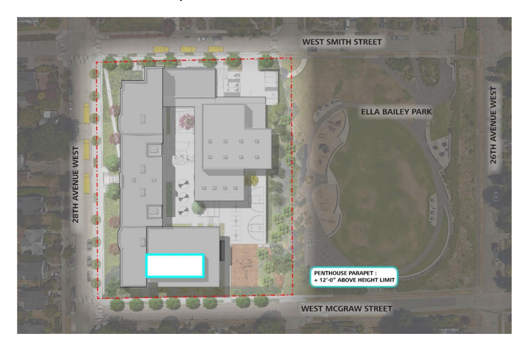
Exhibit 4 Proposed Building Height

For additions to existing public schools on existing public school sites, the maximum height permitted is the height of the existing school or 35 feet plus 15 feet for a pitched roof, whichever is greater. When the height limit is 35 feet, the ridge of the pitched roof on a principal structure may extend up to 15 feet above the height limit, and all parts of the roof above the height limit must be pitched at a rate of not less than 4:12. No portion of a shed roof is permitted to extend beyond the 35 foot limit under this provision.