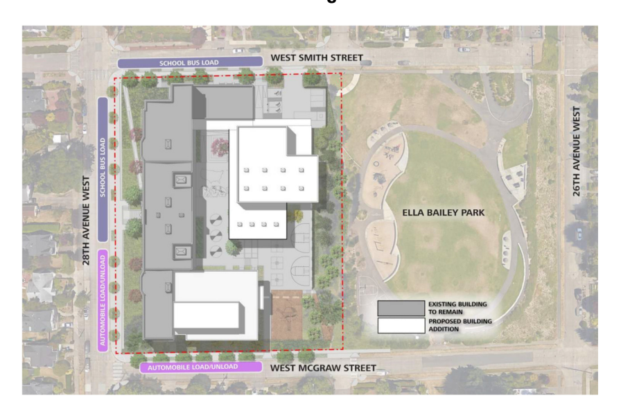
Exhibit 2 Proposed Site Plan