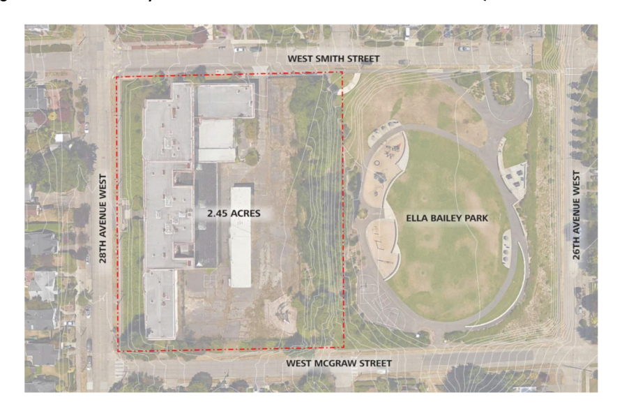
Exhibit 1 Existing Site Aerial

On March 23, 2016, the Seattle Public Schools submitted a request for departures from four (4) Seattle Municipal Code (SMC) Development Standards, and potentially two (2) additional departures that may need to be requested, to accommodate a modernization and addition project at Magnolia Elementary School located at 2418 28th Ave W, Seattle.