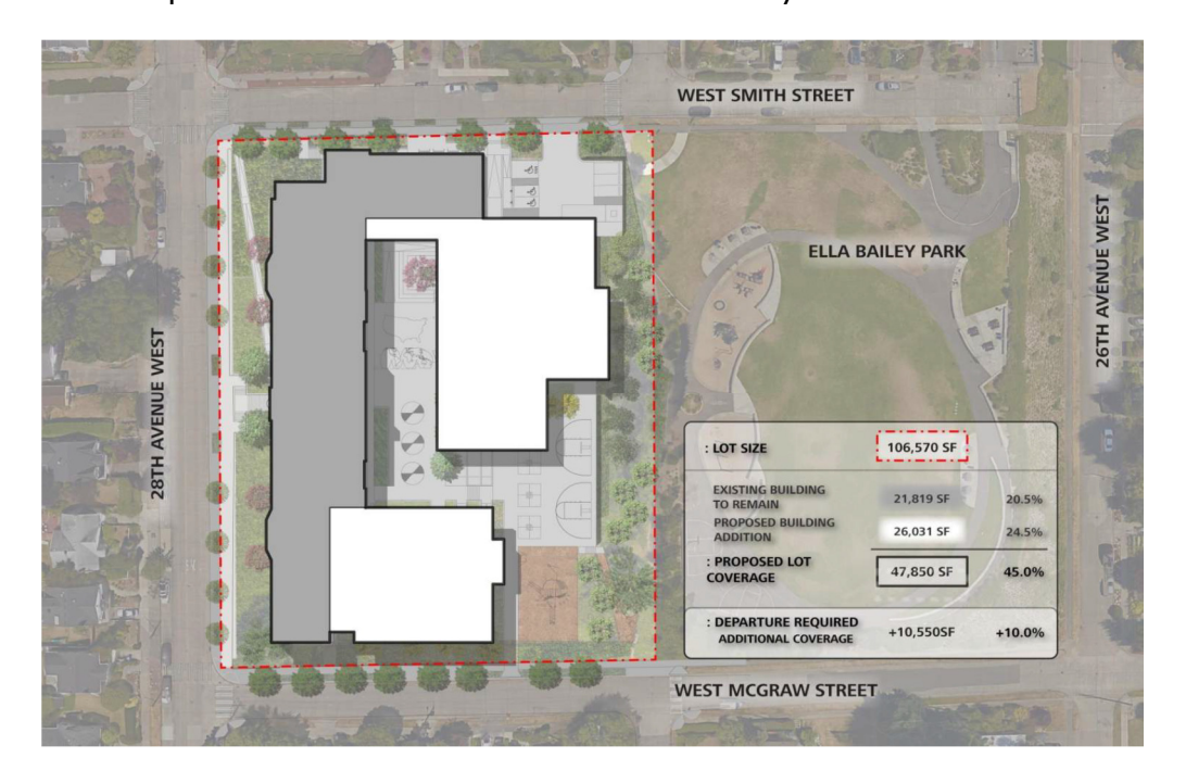
Exhibit 3 Proposed Lot Coverage

For new public school construction on new public school sites the maximum lot coverage permitted for all structures is 45 percent of the lot area for one story structures or 35 percent of the lot area if any structure or portion of a structure has more than one story.