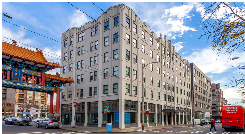
Publix, International District

3 Includes salary, hourly wages, tips, Social Security, child support, and other income.