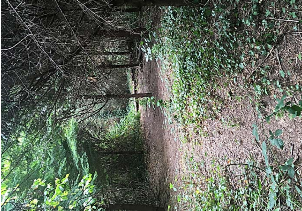
Exhibit A: Site Inspection