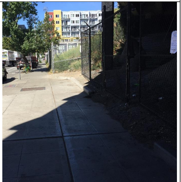
Before and after cleanup along Western Avenue and Bell Street.