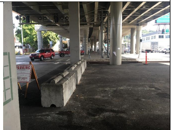
Pictures of before and after cleanup in different sections along the Spokane Street corridor.