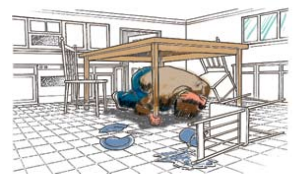
When the earth shakes, DROP to the ground, COVER under a desk or table and HOLD on to the desk or table so it doesn't bounce away. Stay there until the shaking stops.

You and your loved ones can learn to resist the instinct to run by knowing where safe places are in each room of your home and practicing.