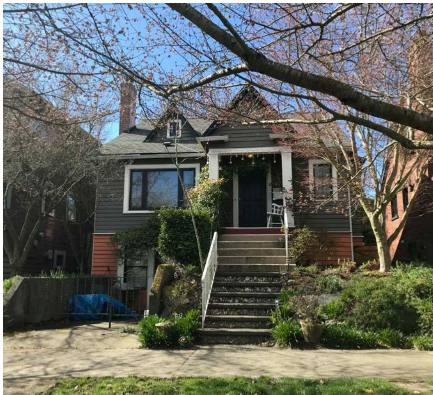
Exhibit 4.3-1 Typical Existing Houses in Seattle (Seattle 2018)