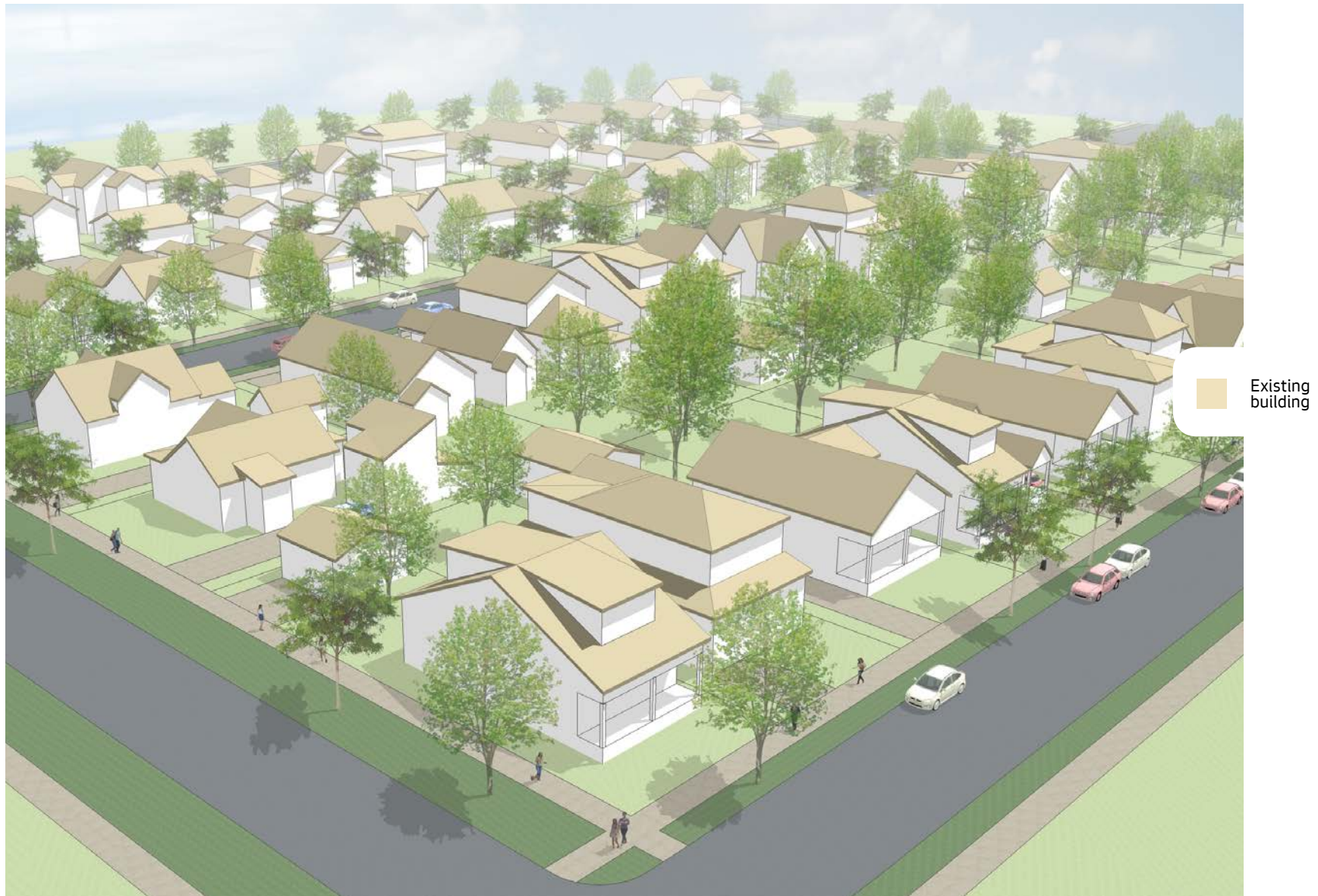
Exhibit 4.3-26 Visual Representation of Development Outcomes in Alternative 3 under Existing Conditions