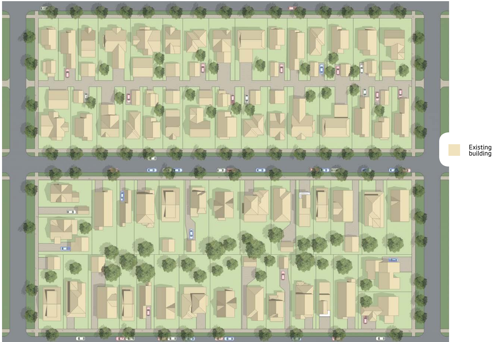
Exhibit 4.3-5 Plan View of Development of Alternative 1 (No Action) under Existing Conditions