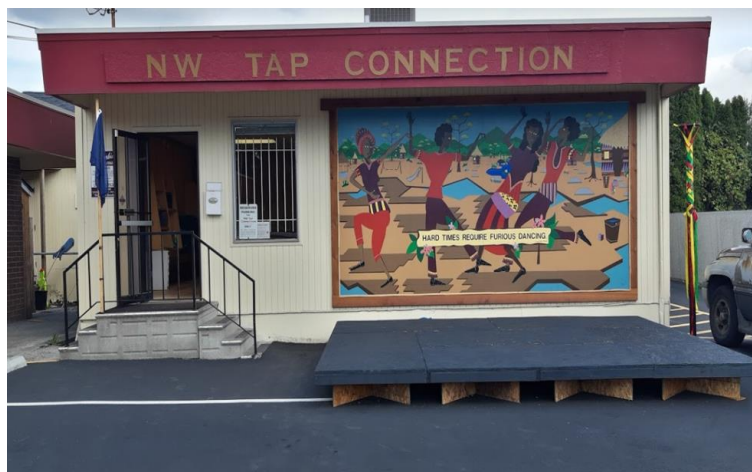
The Facade at Northwest Tap Connection

b) Include Wide Array of Sectors: The literature recommends including a wide array of sectors in these anti-gentrification alliances, including artists, art activists, and environmental justice activists as demonstrated in the Little Village neighborhood of Chicago. The Pilsen Alliance in Chicago includes a number of artists on their board of directors. In Houston, the alliances established outside of Northern Third Ward neighborhood with several nonprofit organizations, academic institutions, and other stakeholders led to the formation of an economic development council whose mission is to resist gentrification.