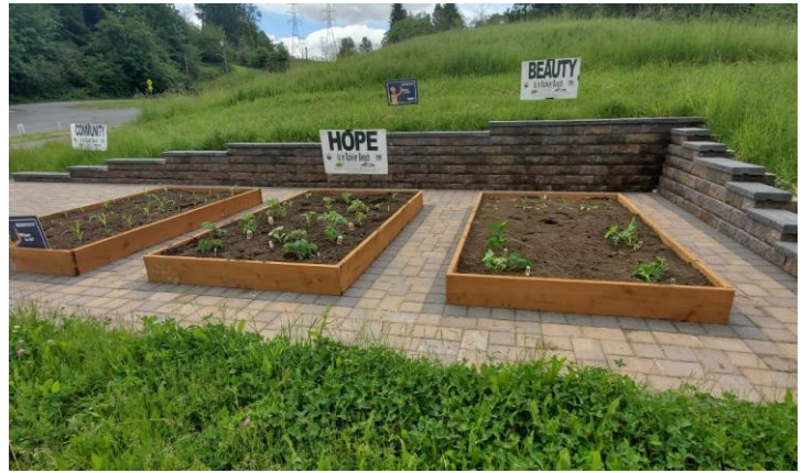
Rainier Beach Action Coalition's Project Reclaim 900 sq. foot land located at the Chief Sealth Trail near Henderson Street