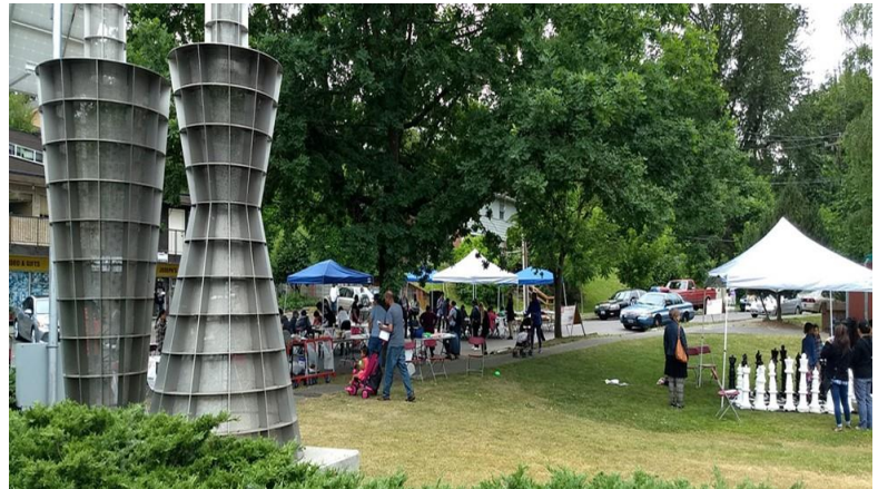
The King and Queen Sculpture at Rainier and 51st Ave

One of the most important things that communities can do to resist gentrification is to take a visible, vocal, unequivocal stance against the displacement of residents. In our literature review, we identified three important ways that communities can signal their resistance to gentrification and assert their rights to thrive in place.