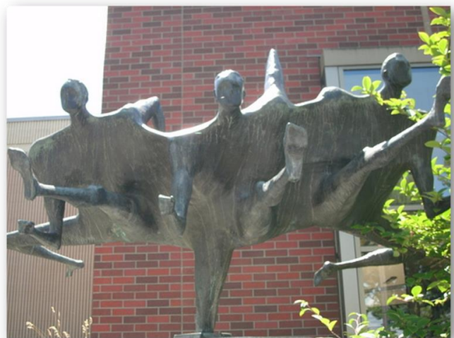
"Pursuit of Knowledge" by Ray Jenson at Rainier Beach Library

Some communities have established reputations for activism such that no new development proposal goes uncontested. For many communities, resistance to gentrification takes decades of work. Communities that establish and sustain capacity for organizing around social justice strategies such as food justice, transportation justice, and others, can also draw on that strength and reputation to resist gentrification.