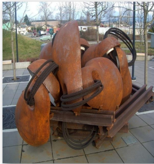
"Parable" by Buster Simpson at Rainier Beach Light rail's Northeast Plaza on South Henderson St.