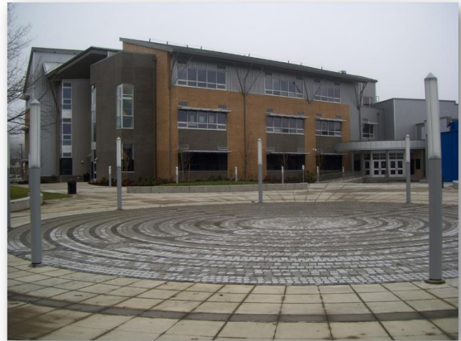
Public art installation in front of Rainier Beach Library

Some research points to the importance of treasured community places as anchors in community resistance to gentrification. These may include local shops, parks, and arts or community centers. These community assets can create a context that promotes residents' sense of place, social cohesion, and well-being. Proximity to visible identity in murals, landscape, and community arts