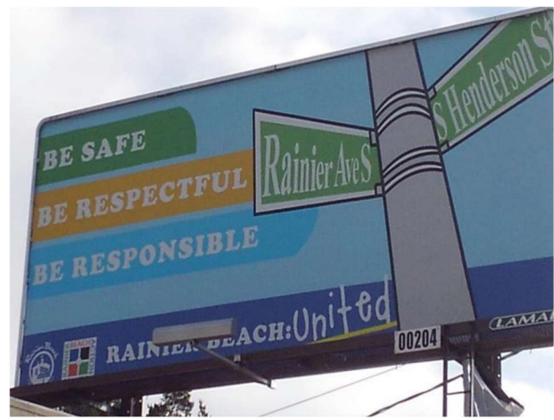
One of four billboards in Rainier Beach that displays the community's values: Be Safe, Be Respectful and Be Responsible

This grant is the first in the nation to expand PBIS to community settings and will involve an assessment of whether the integration of these two frameworks can improve school climate and overall rates of youth crime and community safety.