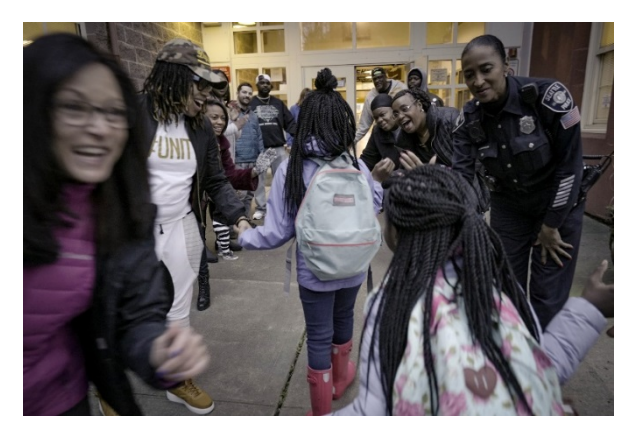
Community members greet students on January 22, 2019 at Emerson Elementary, one of the six Rainier Beach schools implementing PBIS.