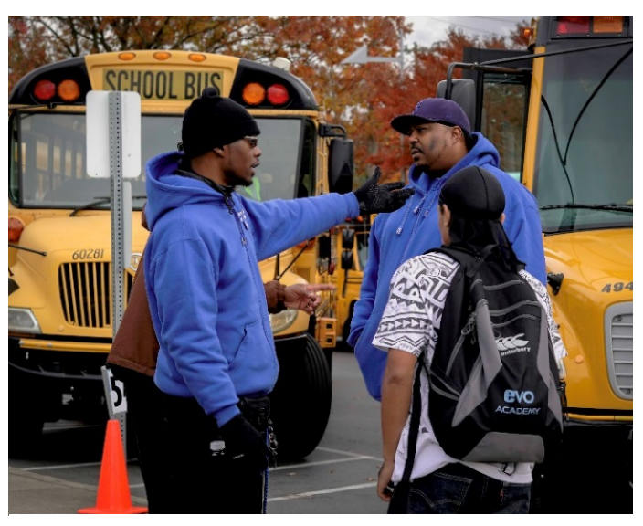
In one of ABSPY interventions, Safe Passage guardians help ensure that Rainier Beach students stay safe after school.