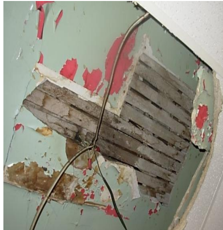
City inspectors cited a substandard interior wall in a Sisley house (left) and hazardous exposed wiring (right).

The imposition of $615,000 in penalties on a Seattle landlord for housing code violations has been affirmed by the Washington Court of Appeals, Division One.