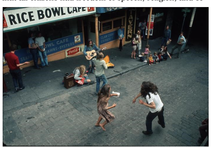
Musicians and dancers, Pike Place Market, 1972. Item 34968, Record Series 1628-02, SMA.

The letter went on to imply that their rights were being infringed in Seattle, reminding the mayor that all citizens had freedom of speech, religion, and so