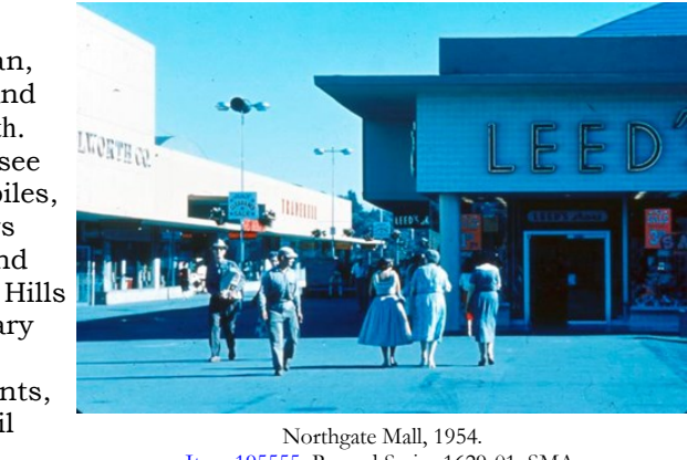
Item 195555, Record Series 1629-01, SMA.

Fahev Brockman. Leed's. and Woolworth. We also see automobiles. Matthews Beach and Olympic Hills elementary schools, restaurants, and retail outlets. All slides are