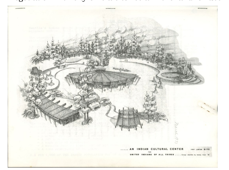
UIATF design sketch for potential Indian Cultural Center, March 1971. Box 15, Folder 4, Record Series 5802-01, SMA.

Launched to coincide with Native American Heritage Month in November, the exhibit explores how a coordinated effort to peaceably occupy the decommissioned Fort Lawton in 1970 triggered years of negotiation with city officials to reclaim the land for use