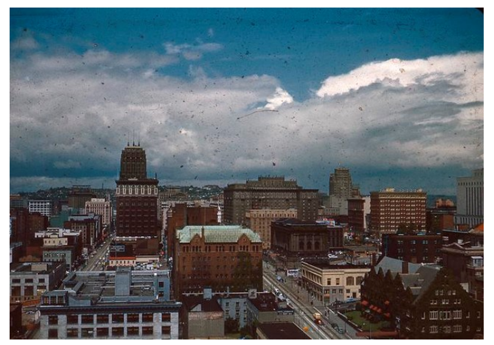
Looking north from around 4th and Cherry, circa 1958. Item 195186, Record Series 2613-08, SMA.

A popular image recently posted to <u>SMA's</u> <u>Flickr site</u> is this color slide showing downtown Seattle around 4<sup>th</sup> and Cherry, circa 1958.