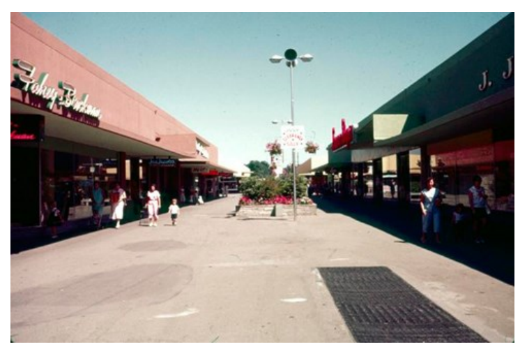
Northgate Mall, 1954. Item 195550, Record Series 1629-01, SMA.

Part of Record Series 1629-01, the newly cataloged slides include images of the nascent Lake City neighborhood showing the construction of Cedar Park school, single family homes, businesses such as Braman's Lumber, and pedestrians along Lake City Way. Views of Northgate Mall include the totem gracing the entrance and shoppers strolling the outdoor mall in summer for a July clearance sale at stores such as