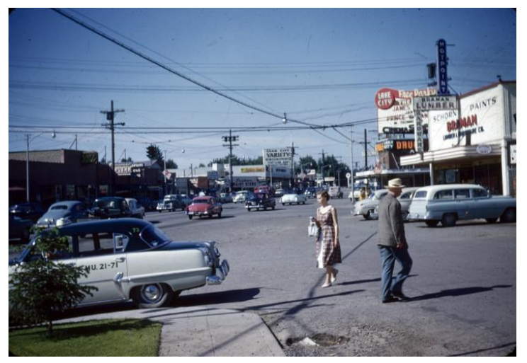
Intersection at 12360 Lake City Way N.E., 1954. Item 195541, Record Series 1629-01, SMA.

Centered along Lake City Way, Lake City stretches from 15th Ave NE to Lake Washington. A relatively remote region until WWII, pre-annexation Lake City transitioned to a township in the 1930s with the Lake City Branch of the Seattle Public Library. Alongside the popularity of the automobile, Lake City grew into a thriving community that connected Seattle to Bothell along SR-522. This neighborhood boasted access to Lake Washington as well as an active economic core along the state route.