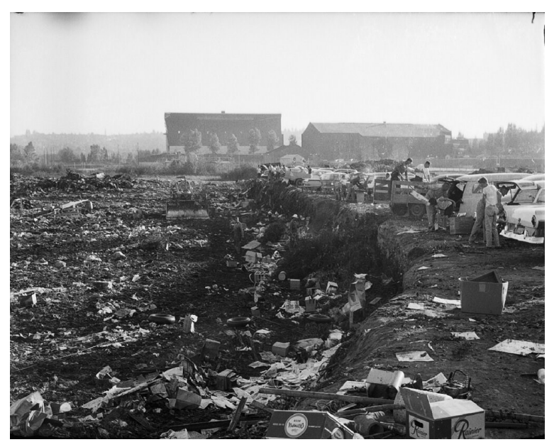
University Garbage Dump, July 1960. Item 65975, Record Series 2613-07, SMA.

Was Husky Stadium built on a garbage dump? Find out in <u>this Seattle Times article</u> featuring photos from SMA collections, exploring the history of the University Garbage Dump and its proximity to Husky Stadium. (Spoiler alert: it wasn't.)