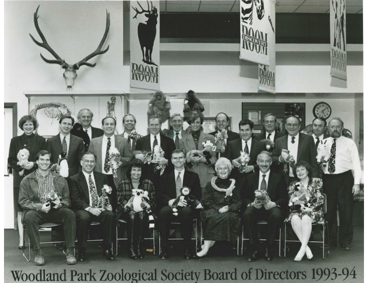
Photo of Woodland Park Zoo Board of Directors, 1994.

zoo's 1976 long-range plan, including building the Asian Elephant Forest exhibit, Tropical Rain Forest exhibit, Education Center, Zoo Store, Animal Health Complex, Northern Trail exhibit and Trail of Vines exhibit.