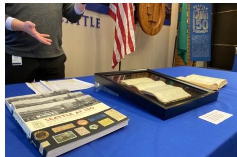
The original Articles of Incorporation, on temporary loan for the December 9 event from the Secretary of State and the Washington State Archives.