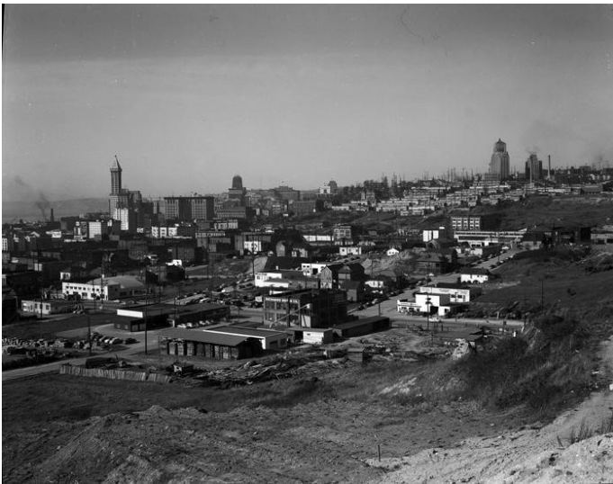
Item 43394 , Engineering Department Photographic Negatives (Series 2613-07), SMA.

A popular photo recently posted to SMA's Flickr site is this view of downtown Seattle taken from Beacon Hill during the construction of I-5.