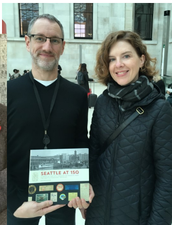
Seattle at 150 delivered to the British Museum (above) and to the London Metropolitan Archives (left).