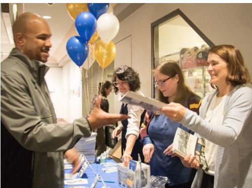
SMA archivists hand out free books to City of Seattle employees at the Seattle at 150 book launch.

The festivities continued on October 24th with a Seattle History Trivia Night co-hosted by SMA and Councilmember Abel Pacheco at the Fremont Dock and Grill. After two rounds of competitive trivia, the winning teams each took home their own copies of Seattle at 150 and gift bags of #Seattle150 goodies.