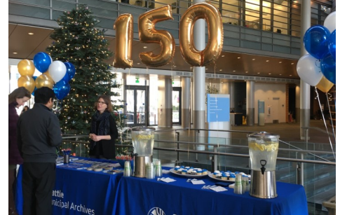
December 2: 150 years to the day!

To mark 150 years to the day since Seattle was incorporated in 1869, SMA held a special anniversary celebration on December 2nd with cupcakes and #Seattle150 swag in the main lobby at City Hall.