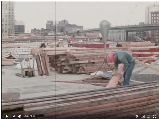
Still from Freeway Park and Garage [1st Phase], 1974-1975 .

Among the more popular videos recently added to SMA's YouTube channel are those showing phases one and two of the construction of the Freeway Park and Garage, 1974-75. Footage includes meetings, construction site work, landscaping, and includes both close-up and aerial shots of the project.