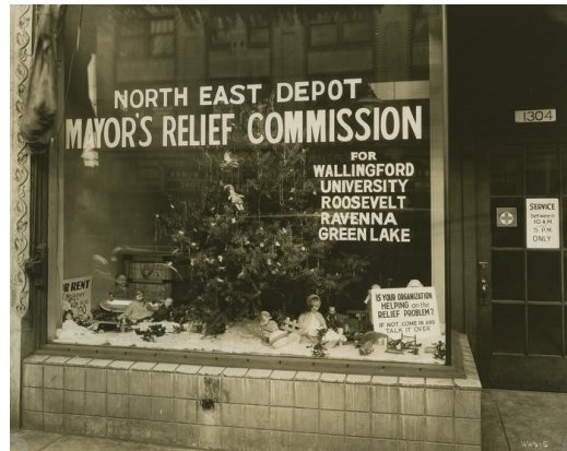
Northeast Relief Depot, located at 1304 E. 45th. Item 193917 , Clerk File Photographs (Series 1802-0P). SMA.

Recently cataloged at SMA are a series of photos taken during the Great Depression showing activities at relief depot locations in Seattle. These offices provided Seattle residents who were in need with provisions such as food, clothing, and other supplies. The photos all date from 1931 and are included in a report by the Mayor's Commission for Improved Employment, filed with the City Clerk's Office in January 1932. See more of the photos on our Digital Collections site .