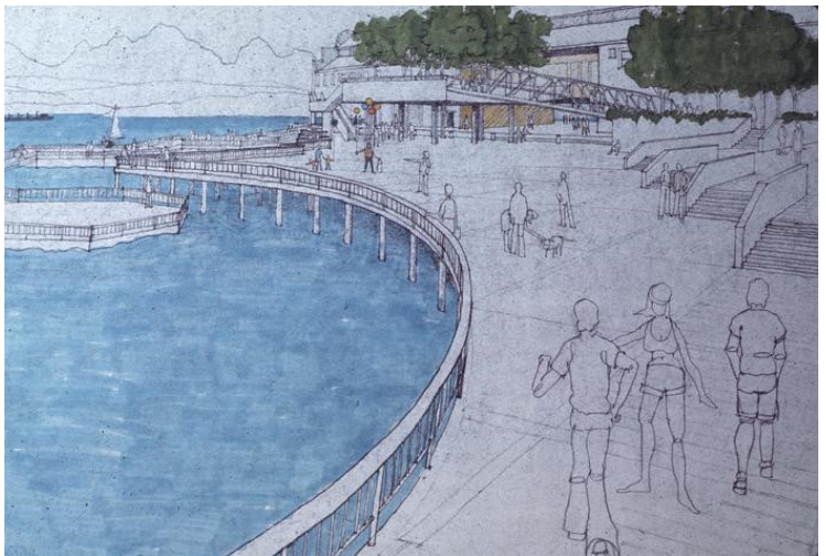
Drawing of Central Waterfront Park Design, 1970.