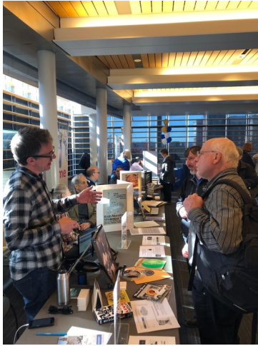
Visitors chat with archivists at the Archives Fair.

Black Heritage Society of Washington State, Seattle Genealogical Society, Lakeside School Archives, Museum of History and Industry, Living Computer Museum + Labs Archives, Museum of Flight Archives, Washington State Jewish Historical Society Archives, Puget Sound Navy Museum, UW Ethnomusicology/Media Archives, and KRAB Archives.