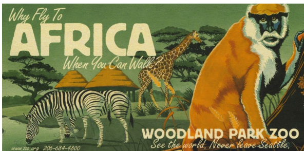
Woodland Park Zoo marketing flyer, 2002. Woodland Park Zoological Society Board Minutes (Series 8604-01), Box 6, Folder 1, SMA.

Also newly processed are the Woodland Park Zoological Society Board Minutes ( Series 8604-01 ), comprising 5 cubic feet and spanning the years 1986-2008. The minutes encompass a time of change and transition for the zoo, when the Society took over management of the zoo through a contract with the city. This period also saw further development of the