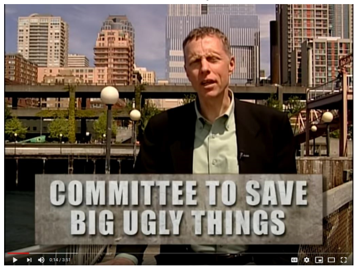
Mayor's Press Conference: Committee to Save Big Ugly Things, 2006 Item 3741, Seattle Channel Moving Images (Series 3902-01), SMA

One of the more popular recent additions to SMA's <u>YouTube Channel</u> is the 2006 faux public service announcement for the "Committee to Save Big Ugly Things," produced as a spoof on those who wanted to save the Alaskan Way Viaduct.