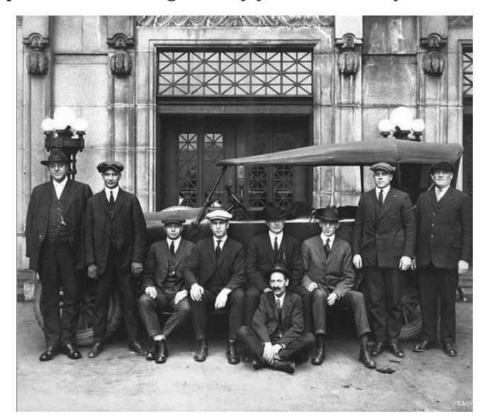
Seattle Police Department Dry Squad, 1921 <u>Item 64762</u>, Miscellaneous Prints (Series 9910-01), SMA

Check out our new online guide to <u>Prohibition</u> <u>in Seattle</u> to learn more about liquor-related crime and punishment during the "dry years" in the city.