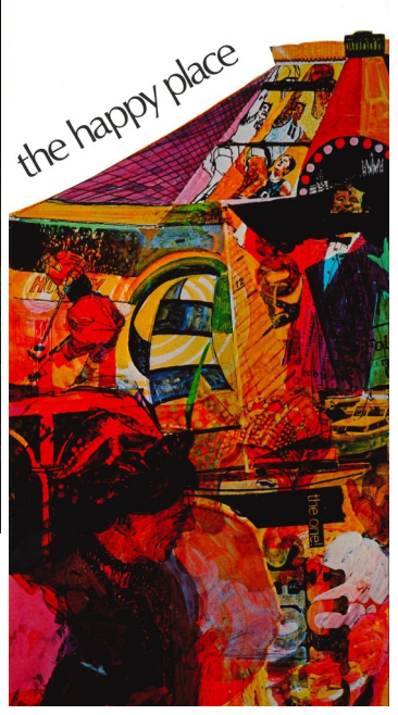
King Tut exhibit postcard, 1978. Series 7613-01, Box 3, Folder 7.

Promotional Packet: Where the Show Goes On, 1980. Series 7613-01, Box 3, Folder 16.