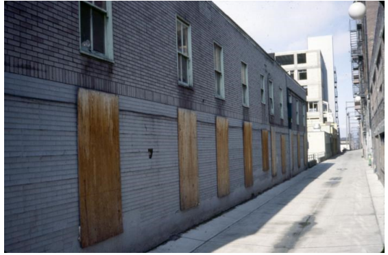
Stewart House and Post Alley [Pike Place Market rehabilitation], circa 1977 <u>Item 192053</u>, (Series 1629-01), SMA.