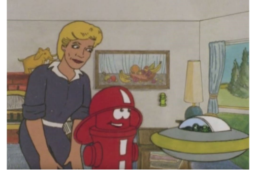
Aliens From Outer Space, 1988. <u>Item 967</u>, Series 2801-11, SMA. Animated fire safety film starring talking fire hydrant Big Red, teaching aliens about household fire safety. Produced and animated by Seattle Fire Department.

Seattle Municipal Archives is grateful to Lightpress for a superb job of working with these films so they can be accessible. They are all available on YouTube for viewing along with other <u>Fire</u> <u>Department</u> films.