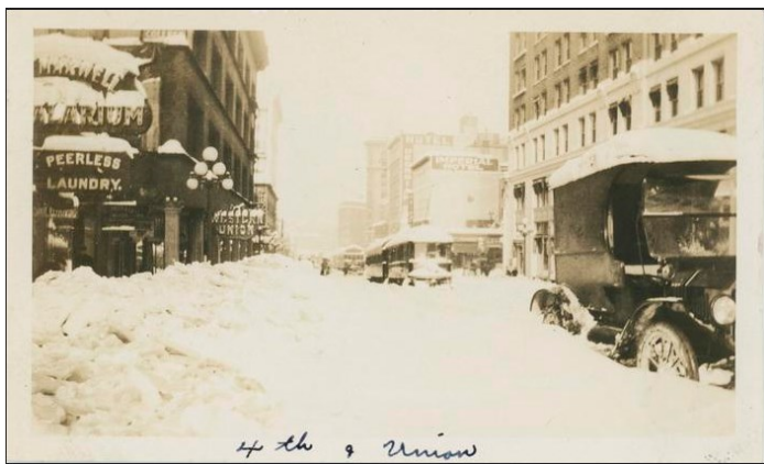
Snow at 4th and Union, 1916