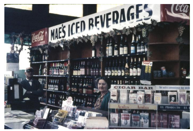
Security Market Closing [Pike Place Market], 1969 Item 192021 (Series 1629-01), SMA.

Also newly cataloged are <u>45 black and white</u> <u>photographs</u> from the Engineering Department showing Pike Place Market in 1968.