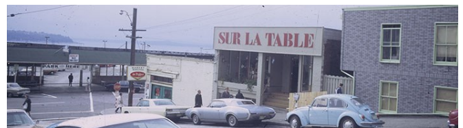
Sur la Table and Stewart House (l to r) on Stewart Street, October 1972.

Read the transcript and listen to the audio recording of either the excerpt or the portion of the meeting that was recorded on the Seattle Voices page.