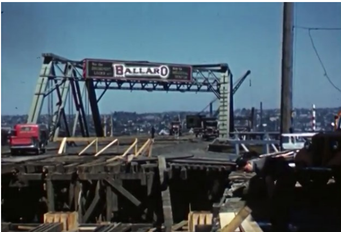
"Construction and opening of Ballard Bridge," 1940.