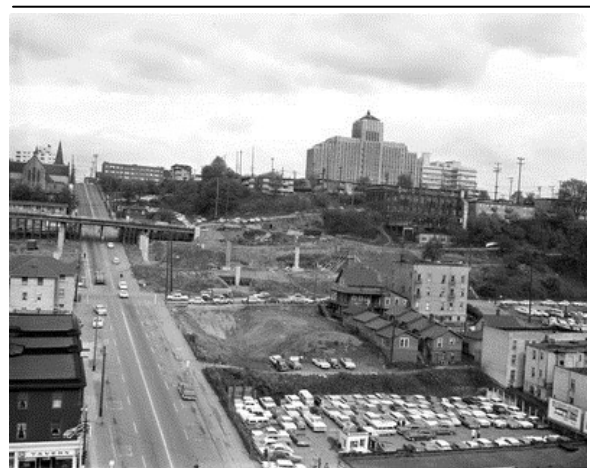
Freeway construction looking up James Street from top of Municipal Building, May 6, 1963 Item 173890