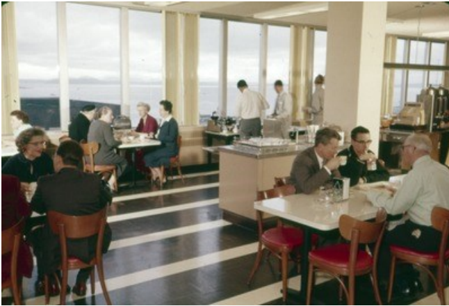
Seattle City Light cafeteria, 1961 Item 177127

The most popular image on SMA's Flickr site in the past three months is a view from the cafeteria in Seattle City Light's building in 1961, facing west.