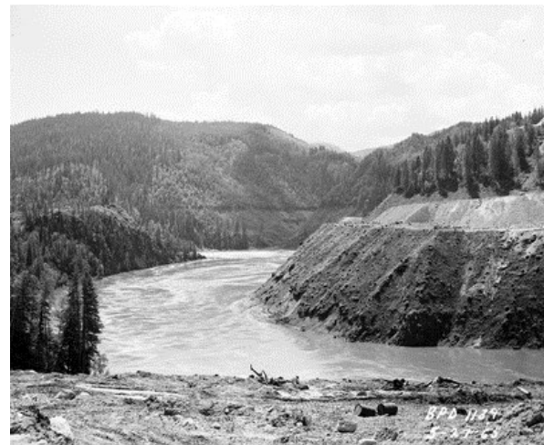
Looking upstream to Pewee Creek showing reservoir clearing. May 27, 1965. Item 172485, Seattle City Light Negatives, Record Series 1204-01