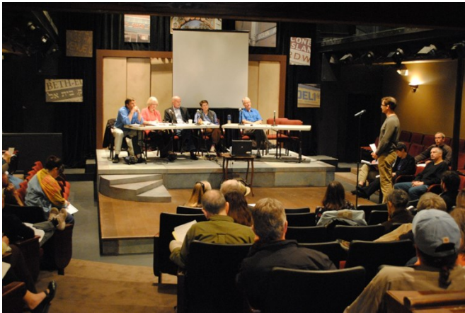
Councilmembers hear from the public at Taproot Theatre in Greenwood, March 2011.

Land use issues, neighborhood planning, transportation, sustainability, housing and income inequality are some of the larger issues she worked on during her tenure. Her records , both electronic and hard copy, include Subject Files and the many committees she chaired: Economic Development and Neighborhood, Planning, Land Use and Neighborhoods, Built Environment, Economic Resiliency and Regional Relations, Housing Affordability, Human Services and Economic Resiliency, among others.