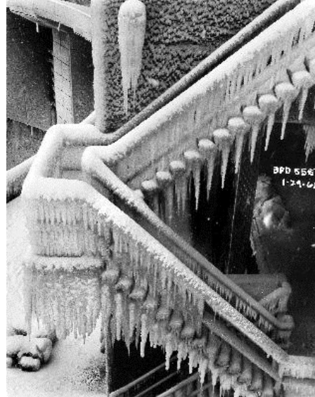
Ice on stairway, west side of spray deck, Boundary Dam. January 29, 1968. Item 110866, Seattle City Light Photographic Negatives, Record Series 1204-01

Almost 200 images of Boundary Dam from 1965 to 1968 are available online .