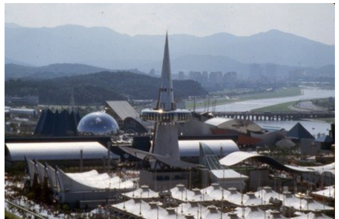
Taejeon, Korea, 1989. Item 176970

In 1994, the Office of International Affairs held a public program called “A World of Magic” allowing Seattle’s citizens to explore more than twenty Sister City relationships. Slides from the program were recently cataloged and digitized to allow access via the Photo Archives online catalog. From Europe to Asia, New Zealand to South America, Indonesia to Uzbekistan, 88 images from 18 Sister Cities highlight the cultural exchange embodied by this program in such elements as agriculture, houses of worship, athletic arenas, parades, education, transportation, civic institutions, street scenes, and more.