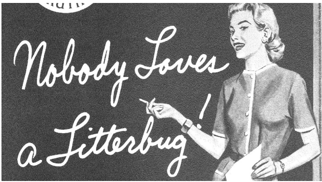
Education materials by “Keep America Beautiful.” Box 38, Folder 11, Office of the Mayor Subject Files, Record Series 5210-01.

Buoyed by the “Keep America Beautiful” campaign by the National Public Service Organization for the Prevention of Litter, the Mayor corresponded with Detroit, New York and other cities regarding how they enforced their anti-litter laws and how they raised money to beautify their cities. “Keep America Beautiful” also created teachers’ guides for both elementary schools (“Nobody Loves a Litterbug!”) and high school (“It’s Everybody’s Job!”).