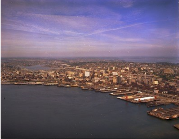
Aerial of waterfront and downtown, 1968 Item 78786

The most popular image on SMA's Flickr site in the past three months is a 1968 aerial view of downtown and the waterfront.