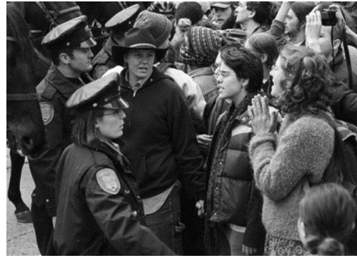
Mounted police and WTO protesters, Nov. 29, 1999.

Black and white as well as color images of the World Trade Organization protests in 1999, from the Fleets and Facilities Imagebank record series, were added to the online database.