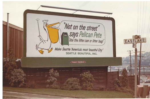
Seattle Beautiful, Inc., a citizens’ group, adopted Pelican Pete as their mascot.