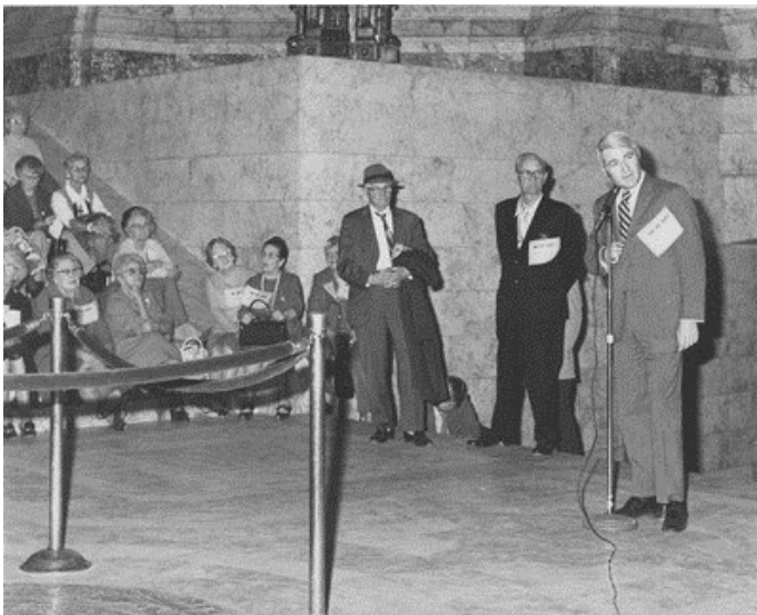
Mayor Wes Uhlman testifying in Olympia on "Save our Buses," 1973. Item 176814

Black and white as well as color images of the World Trade Organization protests in 1999, from the Fleets and Facilities Imagebank record series, were added to the online database.