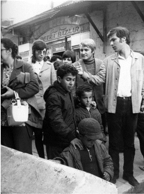
Mayor Wes Uhlman tours Jerusalem, 1971. Item 176849

Images from Mayor Uhlman's records, 5287-04, were also scanned and include some international visits as well as local events.