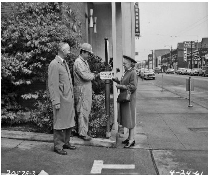
Installation of “No Litter” sign at University Way and NE 47th, April 24, 1961.

Signs were posted to enforce the litter law. By the end of 1961 over 500 litter receptacles had been installed, heavily concentrated in the downtown area.