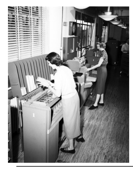
IBM machines in use at City Light, May 5, 1954. Item 78663, Seattle Municipal Archives