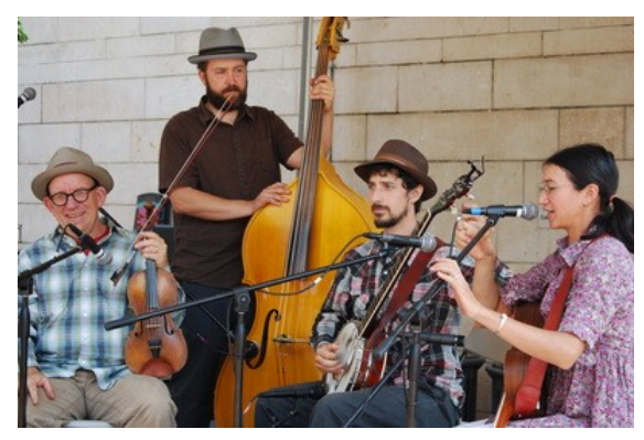
Tall Boys String Band, performing at City Hall as part of Seattle Presents, August 5, 2009 Item 166218, Seattle Municipal Archives

Among the more than 700 new born-digital images dating from 2009 to 2012 added to the Photograph Index in May are photo of local artists who performed at Thursday afternoon concerts at City Hall.