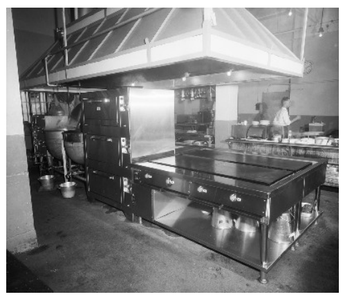
King County Jail Kitchen, April 1957 Item 67967

Newly cataloged and scanned historical images include Seattle City Light photographs of commercial and other uses of electricity, as well as employee scenes.