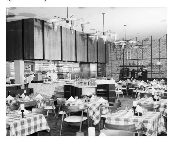
Clark's Village Chef Restaurant, University Village, 1960. Item 66941