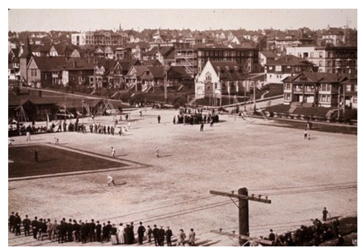
Lincoln Park Playfield, now known as Cal Anderson Park, 1909

The most popular Flickr image for March through May: