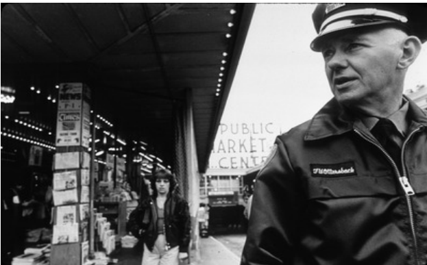
First Avenue Project, November 1981

Flickr commenters continue to provide us with more information about the people and places depicted in our photographs. An image of a swimming instructor with two small boys prompted someone to write that the man had "taught swimming at West Green Lake beach for many years. He was my mother's teacher in the 30s and then taught me in the early 50s."