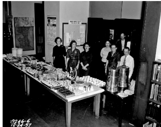
Engineering Department Office Party, December 1957 Item 56407, Seattle Municipal Archives

Total images available online = 130,704 Number of scanned historic images = 76,498