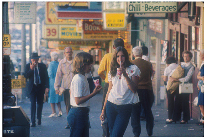
Pedestrians on First Avenue, 1975

The most popular image on the Seattle Municipal Archives Flickr site for August through November was of First Avenue in 1975: http://www.flickr.com/photos/seattlemunicipalarchives/4948398055/