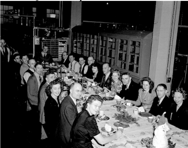
Seattle City Light Meter Division Holiday Party, December 1944 Item 19271, Seattle Municipal Archives