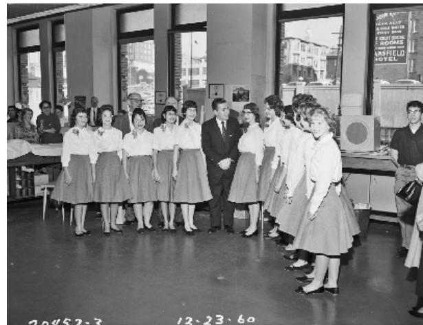
Mayor Clinton with the holiday entertainment, December 1960 Item 66111, Seattle Municipal Archives