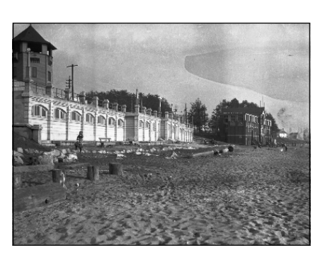
English Bay Bathhouse, Vancouver, 1910. Item 52042, Seattle Municipal Archives

with no indication as to where it was taken. Commenters used shadows, a streetcar number, business names, and a church tower to identify the