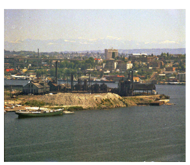
Gas Works Park before it was a park, May 1971. Item 77122, Seattle Municipal Archives

http://www.flickr.com/photos/ seattlemunicipalarchives/4840938901/