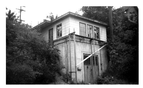
Photograph submitted with letter from Vern Millman regarding building permit at 1857 Ravenna Blvd. Accompanying CF 225076. Item 75134, Seattle Municipal Archives.

Vern Millman wrote on August 5, 1954, "We question the justification for permitting living quarters to be built over an unsightly structure.... Also...we feel that at least the work should be