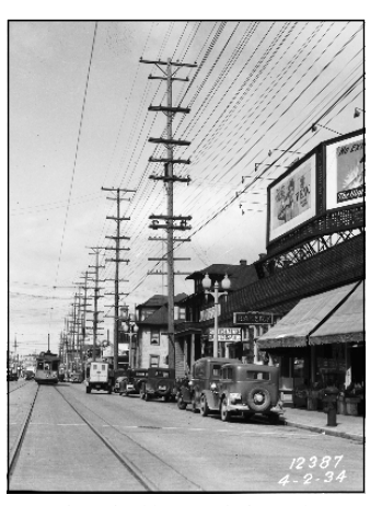
Broadway looking north from about Thomas, March 24, 1934 Item 8760

The interactive nature of our Flickr page has the advantage of allowing us to collect new and corrected information about our images. Commenters often point out interesting details in our photos and give more information