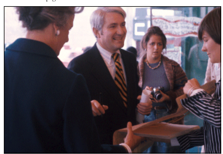
Mayor Uhlman at Pike Place Market anniversary in August 1976. Item 36726, Seattle Municipal Archives