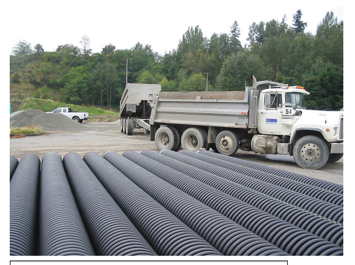
Early site construction, September 2004. Item 159357

The Seattle Municipal Archives recently received, cataloged, and uploaded to the Photography Collection website over 1,500 digital photographs documenting the construction of the Joint Training Facility in White Center. This state-of-the-art facility serves the combined training needs of the Fire Department, Seattle Public Utilities, and the Seattle Department of Transportation. Along with classroom space, this complex includes a six-story high drill tower, overpass prop, collapsed building prop, trench prop, burn building, and vehicle extrication and foam area. Construction began in 2004 and the facility was dedicated in January, 2008 after the settlement of wetlands restoration controversies. These photos can be viewed by typing "Joint Training Facility" into the search box at the Municipal Archives online Photography Index.