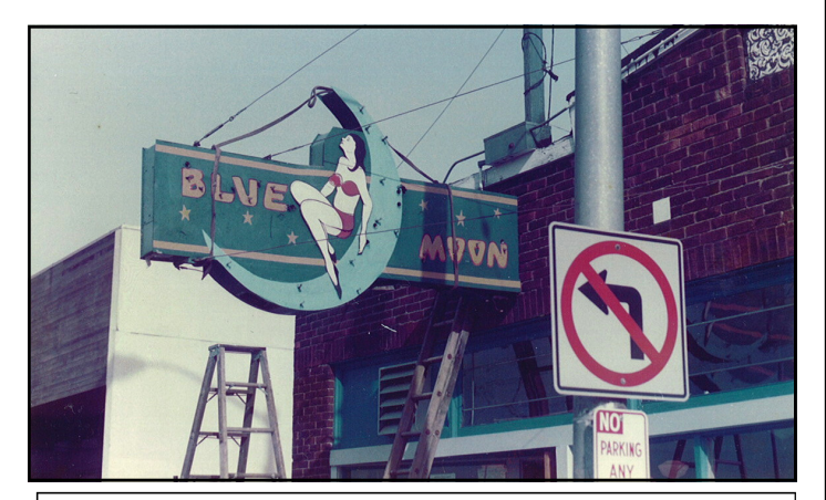
Snapshot of the Blue Moon signage. Department of Neighborhoods, Denied Landmark Applications (5754-A5), Box 3, Folder 2.

Some properties documented in the collection include Franklin High School, the Music Box Theatre, the Newhalem buildings owned by Seattle City Light, and the Olympic Hotel. The Blue Moon Tavern files contain many interesting items of note including letters of support from authors Tom Robbins and Calvin Trillin and an audio cassette containing a KRAB radio station interview with Blue Moon regulars.