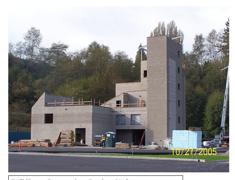
Drill Tower Construction, October, 2005. Item 159357 , FFD Capital Programs Division Photos, Seattle Municipal Archives