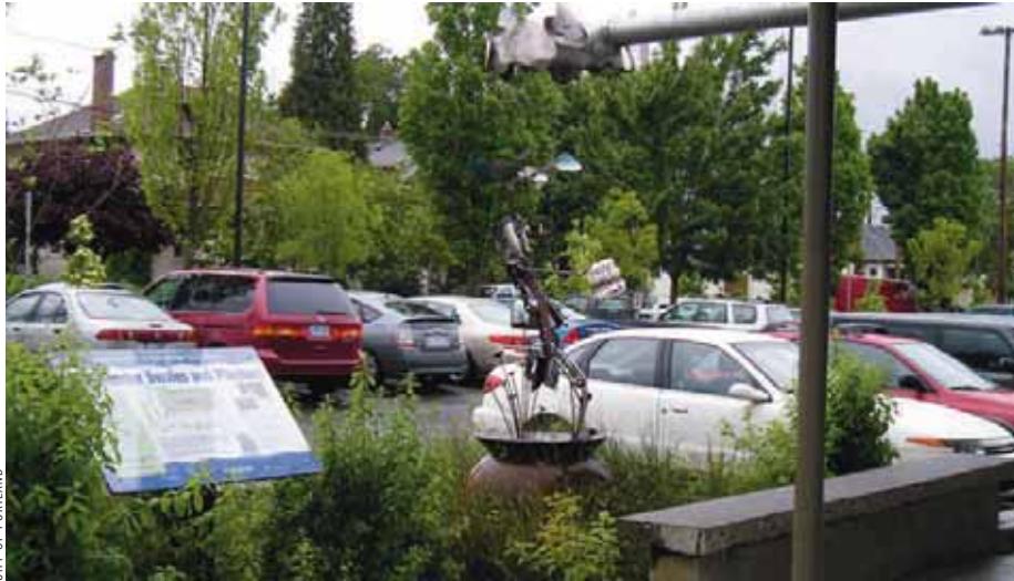
CITY OF PORTLAND

[2.4-m-] wide space,” explains landscape architect Kevin Robert Perry, who designed the Southwest 12th Avenue green street. Perry’s stormwater planters capture nearly all this part of the street’s annual runoff, estimated at 180,000 gallons (681,000 liters). In fact, a simulated flow test has shown that stormwater planters on that section of the street can reduce by at least 70 percent the runoff intensity of even storms that can be expected to occur once every 25 years.