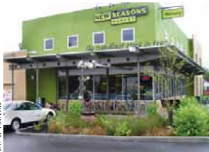
CITY OF PORTLAND

While the plant species chosen—grooved rush and tupelo for the planters, and nandina and liriope for outside the planter box—are adequate for the job, the planting plan could be improved by adding a greater diversity of plants. The stormwater planters are well integrated into