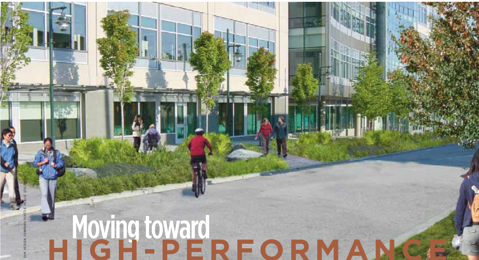
SVA DESIGN COMPANY/SEATTLE PUBLIC UTILITIES