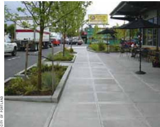
CITY OF PORTLAND

Portland’s New Seasons Market, a locally owned neighborhood grocery store, was designed to infiltrate 1 million gallons (3.8 million liters) of stormwater annually from the market’s rooftop, outdoor plaza, and parking lot drains to interconnected stormwater swales. Three stormwater planters in a planting strip between the sidewalk and street curb slow and filter runoff from the street.