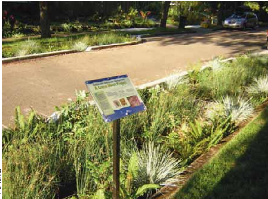
CITY OF PORTLAND

Alexandria, Virginia's central library uses French drains (below) to take roof water to rain gardens.