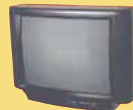
Televisions & Computer Monitors, Electronics

CALL 1-800-RECYCLE OR GO TO www.TakeItBackNetwork.org