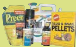
Lawn & Garden Products