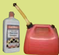
Flammable Liquids Limit: up to 30 gallons of gasoline