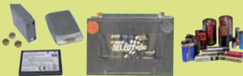
Batteries: Household & Vehicle Limit: 5 car batteries