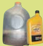
Used & Unused Motor Oil