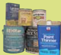
Oil-based Paints, Thinners & Stains No Latex