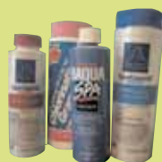
Pool & Spa Supplies