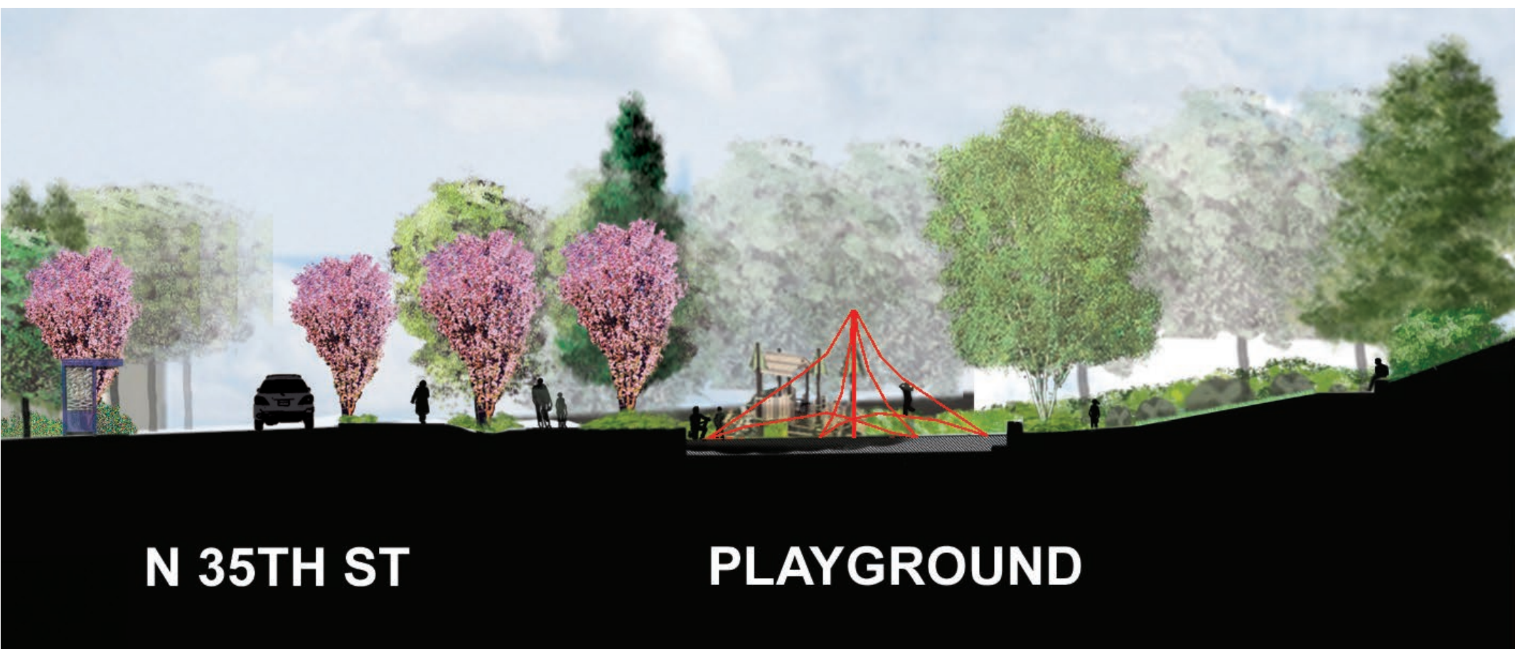
Elevation Section E