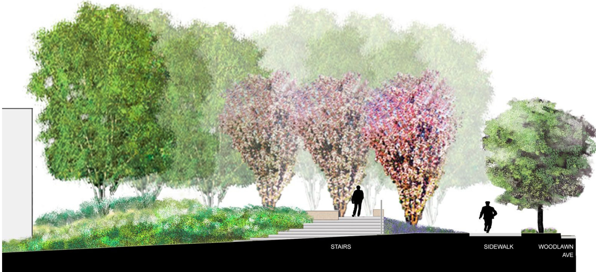
Elevation Section G