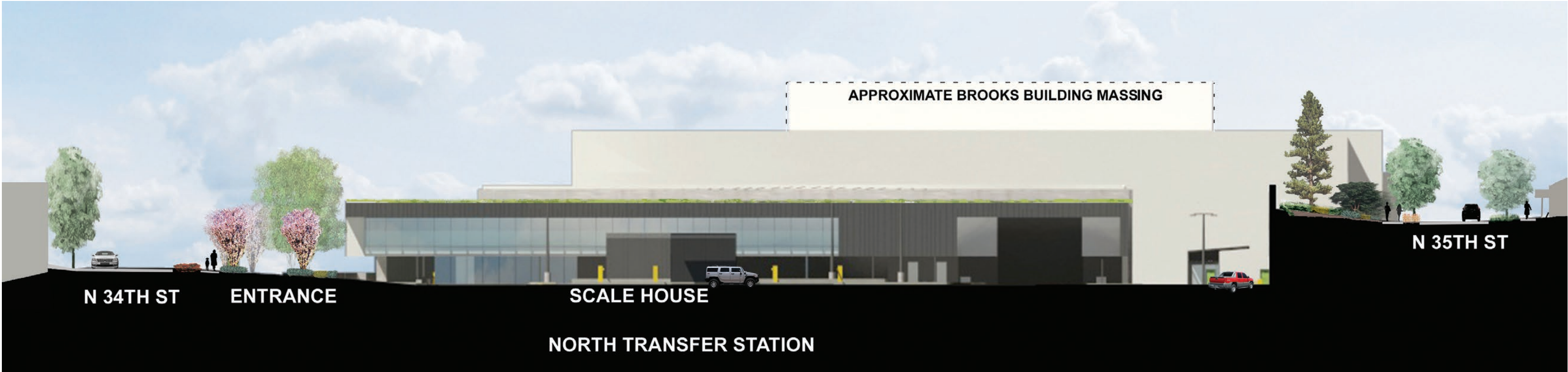
Elevation Section B