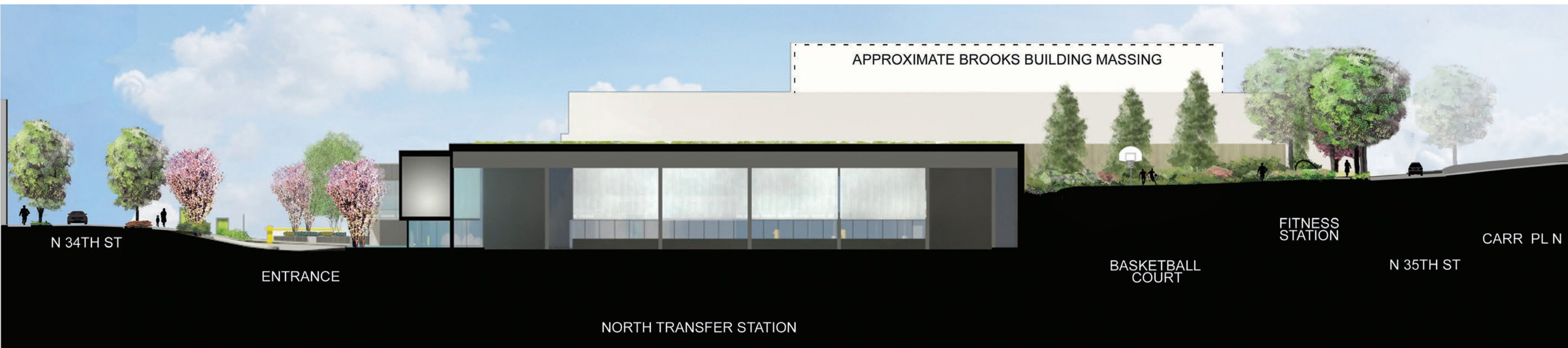
Elevation Section C