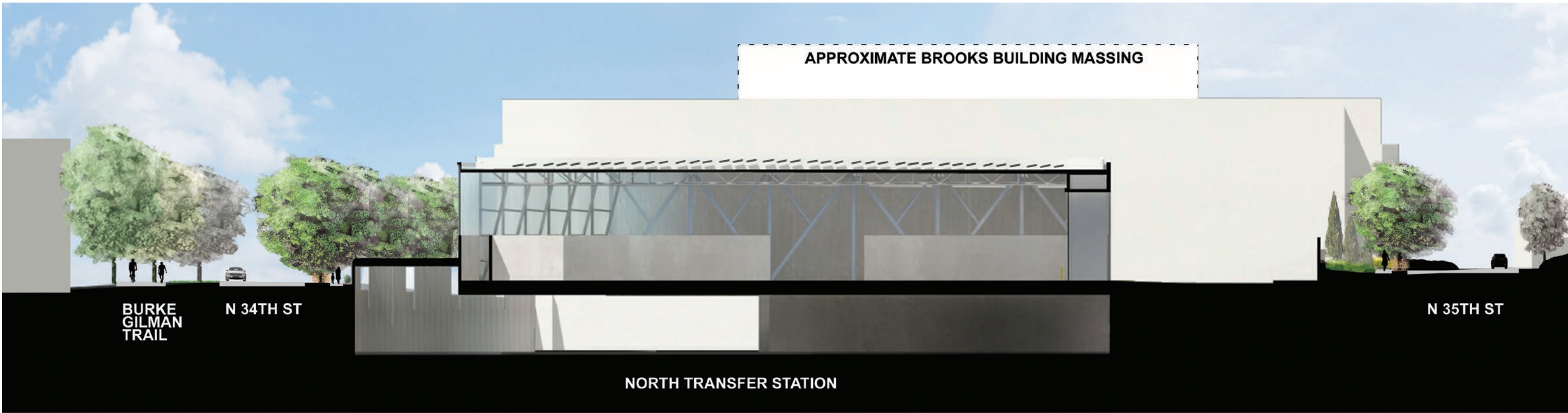
Elevation Section A