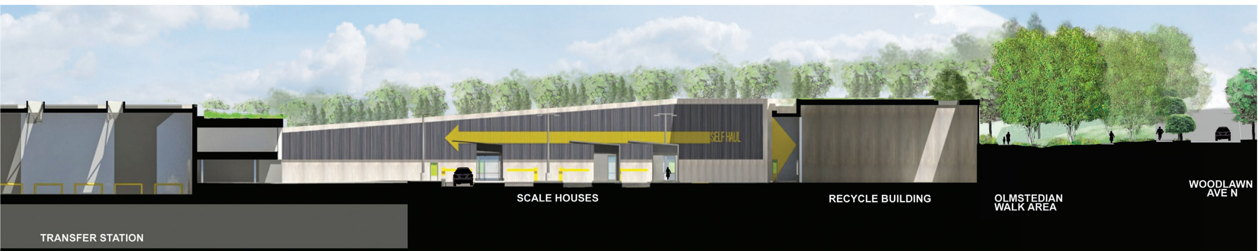
Elevation Section F