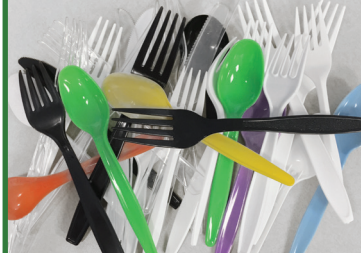
Disposable Plastic Utensils