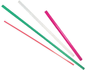
Disposable Plastic Straws