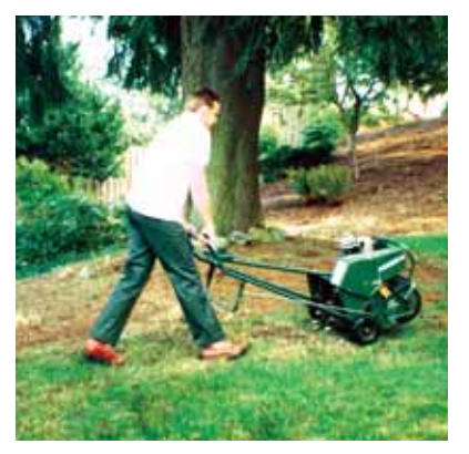
You can rent an aerator, or get a yard service to aerate for you.

Accept a few weeds, and crowd out problem weeds by growing a dense healthy lawn. Use a long handled weed puller to easily remove dandelions without bending over. Weeding is easiest when the soil is moist. If you want to use weed killer, don't spread "weed and feed" all over (it gets into our streams) – just spot spray the problem weeds.