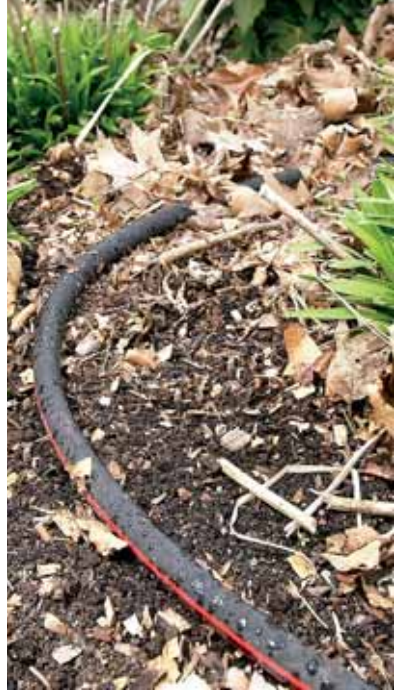
Soaker hoses save water! Cover them with mulch to save even more.