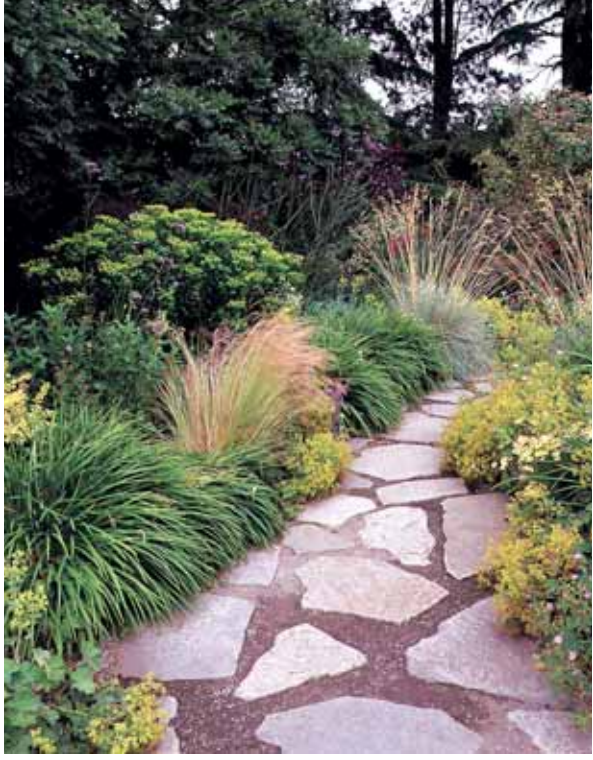
Waterwise Garden at the Bellevue Botanical Garden

Select plants that grow well in the Northwest and fit the sun, soil, and water available in your yard. Native plants are best near waterways, and also work well on many other sites. Think about how big a tree or shrub will be when mature (especially next to houses or under powerlines). Look around at neighbors' yards, nurseries, books, and demonstration gardens for plants that do well in sites similar to yours.