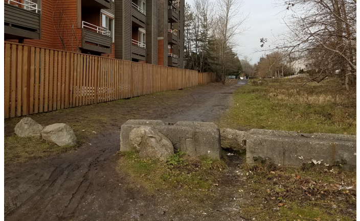
Existing unimproved walkway on 25th Ave SW at SW Trenton St