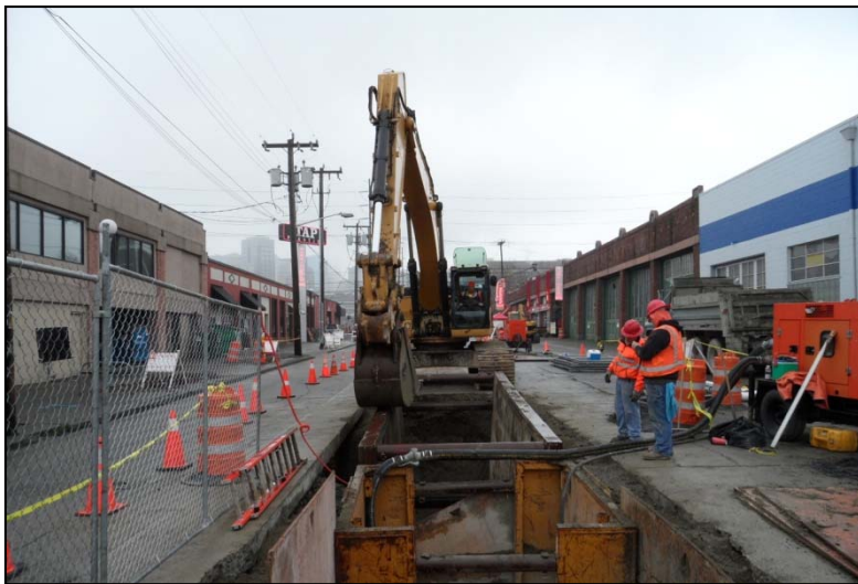
Sewer replacement work continues on parts of 9th Ave. N.