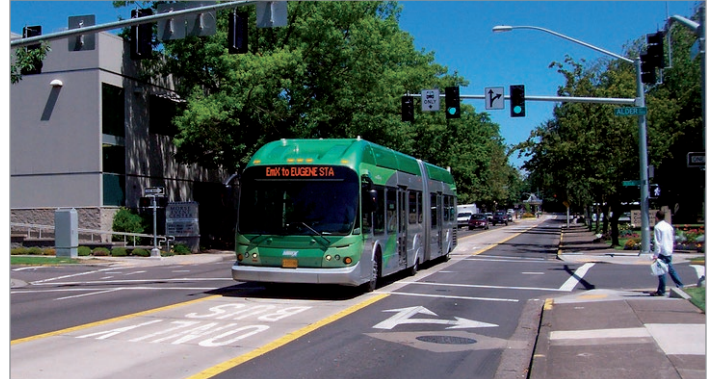
EmX, Eugene, Oregon

The Madison Street corridor is an opportunity for Seattle to design and implement state-of-the-art bus rapid transit (BRT) improvements. The 2.1-mile corridor will run from Colman Dock to 23rd Avenue and will improve access to neighborhoods and employment centers from downtown Seattle to First Hill, Capitol Hill and the Central District. Enhanced east-west connections and transfers to Third Avenue transit, Link light rail, the Center City Connector, and the First Hill streetcar will also expand mobility options beyond the corridor.