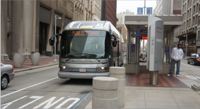
HealthLine, Cleveland, OH