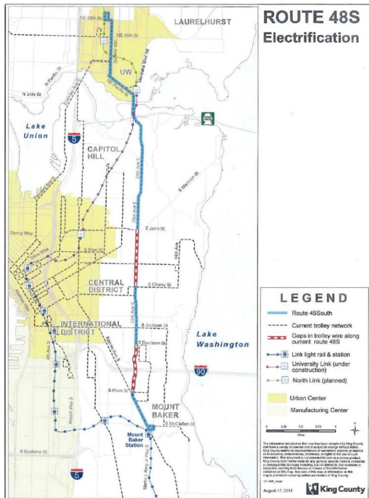
Figure ES-1 Route 48 South Corridor and Overhead Wire Gaps