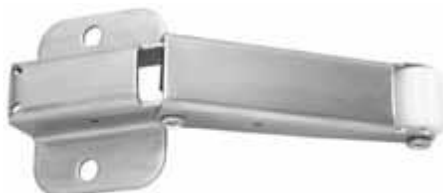
Figure 5.2.6. Carry Bar

Carry bars shall be installed for all door pairs. Carry bars shall be Rockwood 1100 or an equal approved by SCL prior to construction. See Figure 5.2.6.