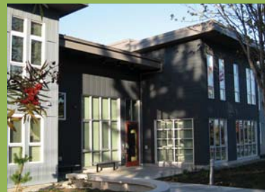
Kenyon House, 18 units for homeless adults living with HIV/AIDS. Achieved LEED Platinum certification. Housing Resources Group

With a deferred down-payment loan, people who work in Seattle—in health care or education, in banking, retail and other service jobs—can afford to live in Seattle.