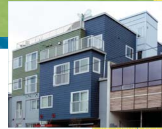
Fremont Solstice Apartments, Capitol Hill Housing