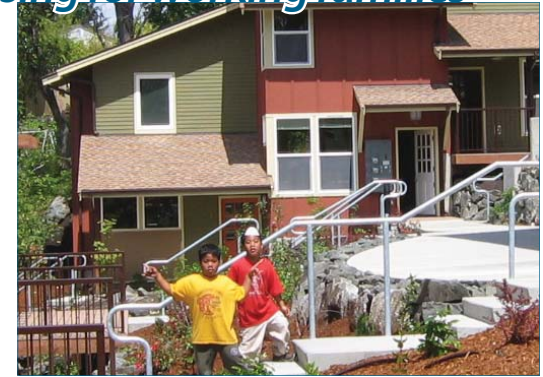
Croft Place Townhomes, 21 units of family housing. Delridge Neighborhoods Development Association

Families can afford to pay rent and still have enough for groceries and other necessities. A stable home allows children to succeed.