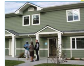
Highline Village, Highline West Seattle Mental Health