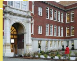
Urban League Village at Colman School, Urban League of Seattle