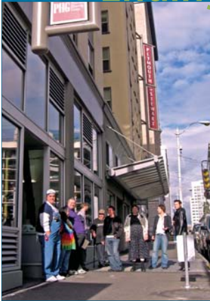
Plymouth on Stewart, 87 units for formerly homeless individuals. Plymouth Housing Group