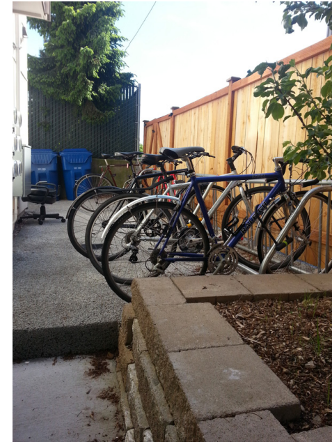
Bike Storage Common Area

315 10th Ave (LEED Platinum) MR | 5 dwelling units, 36 micros | 5 Stories above grade