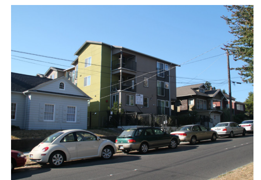
3 stories above grade, 1 story below grade