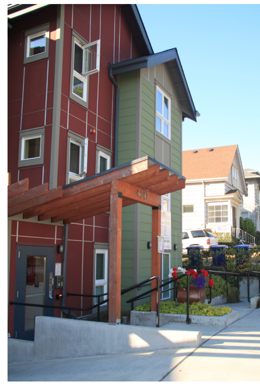
University District 4047 8th Ave NE LR3 Zoning