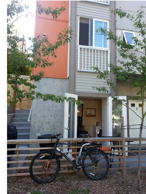
Shared Kitchen and Outdoor Seating