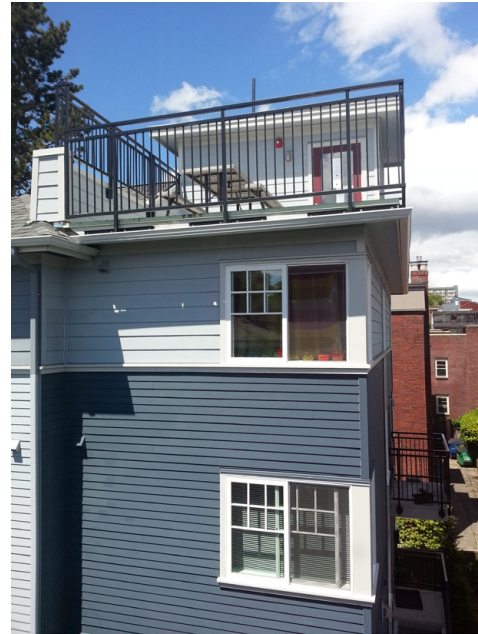
Rooftop Deck Common Area

315 10th Ave (LEED Platinum) MR | 5 dwelling units, 36 micros | 5 Stories above grade