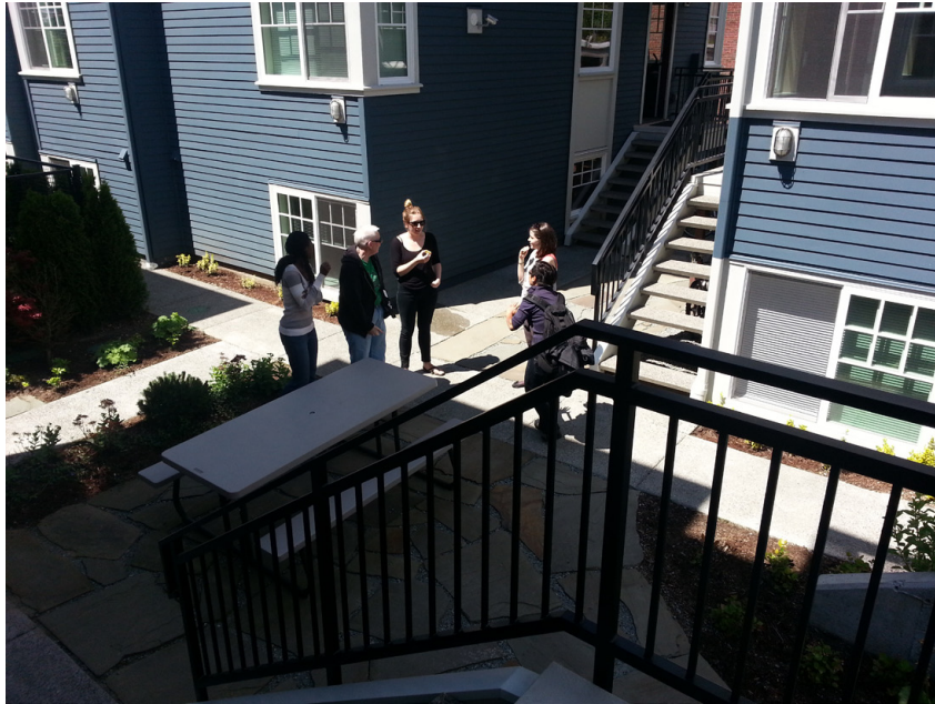
Cortyard Common Area

1304 E John St, 210 13TH AVE E (3 townhouse buildings) LR3 | 8 dwelling units, 56 micros | 3 Stories above grade