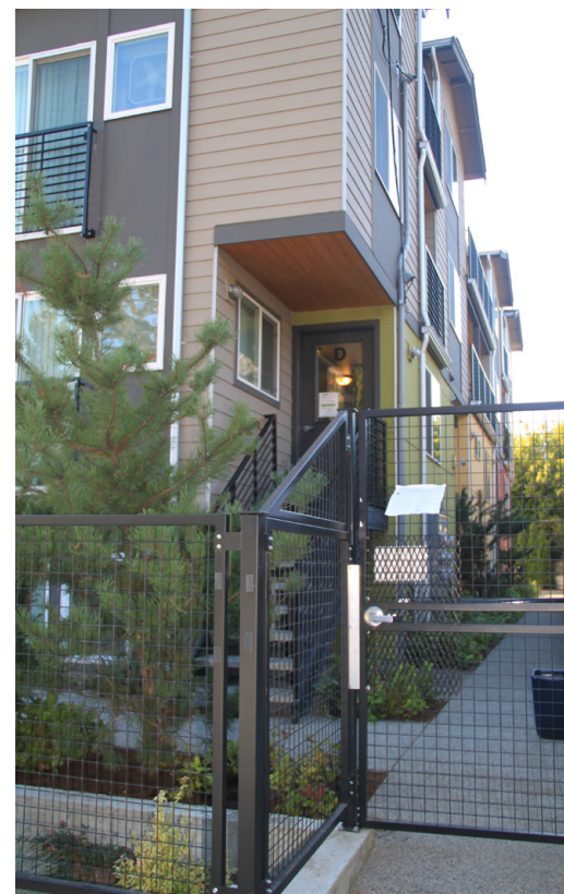
University District 4309 7th Ave NE LR3 Zoning