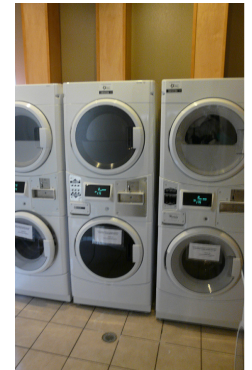
Shared Laundry Area