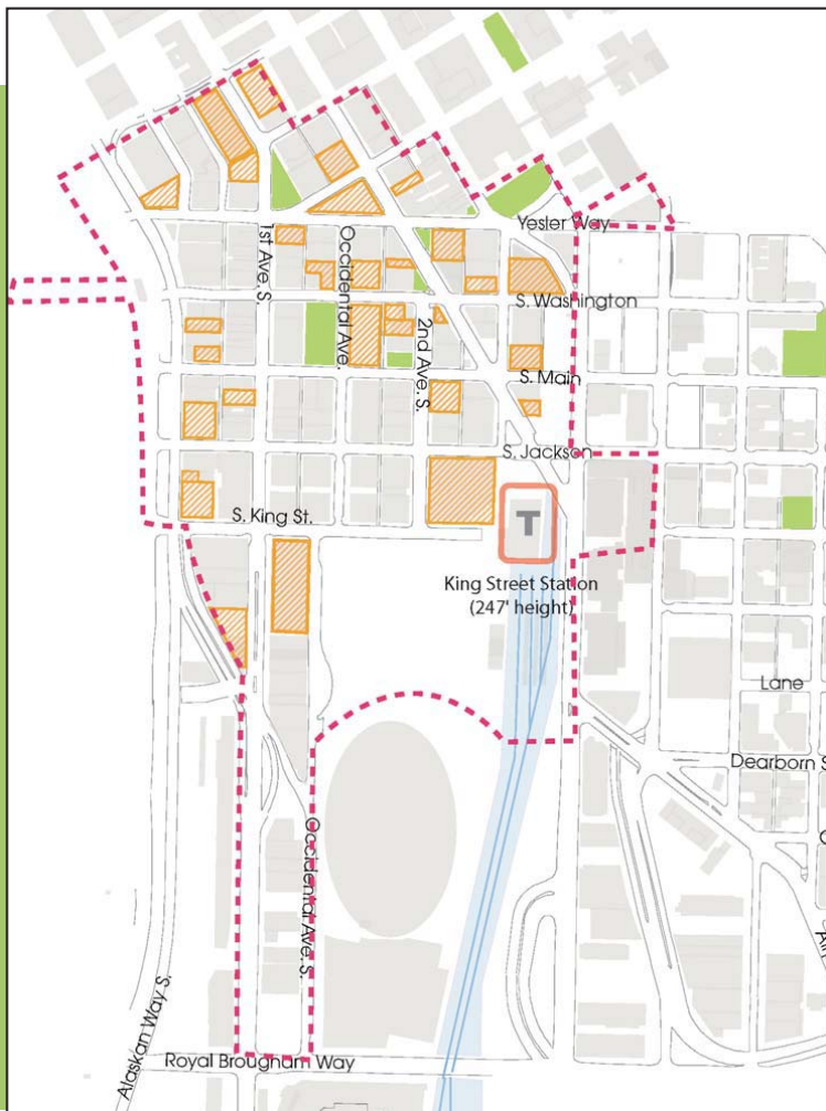
Potential Historic Non-contributing Properties