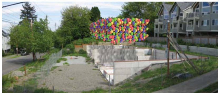
facing east, W Florentia St and 1st Ave W