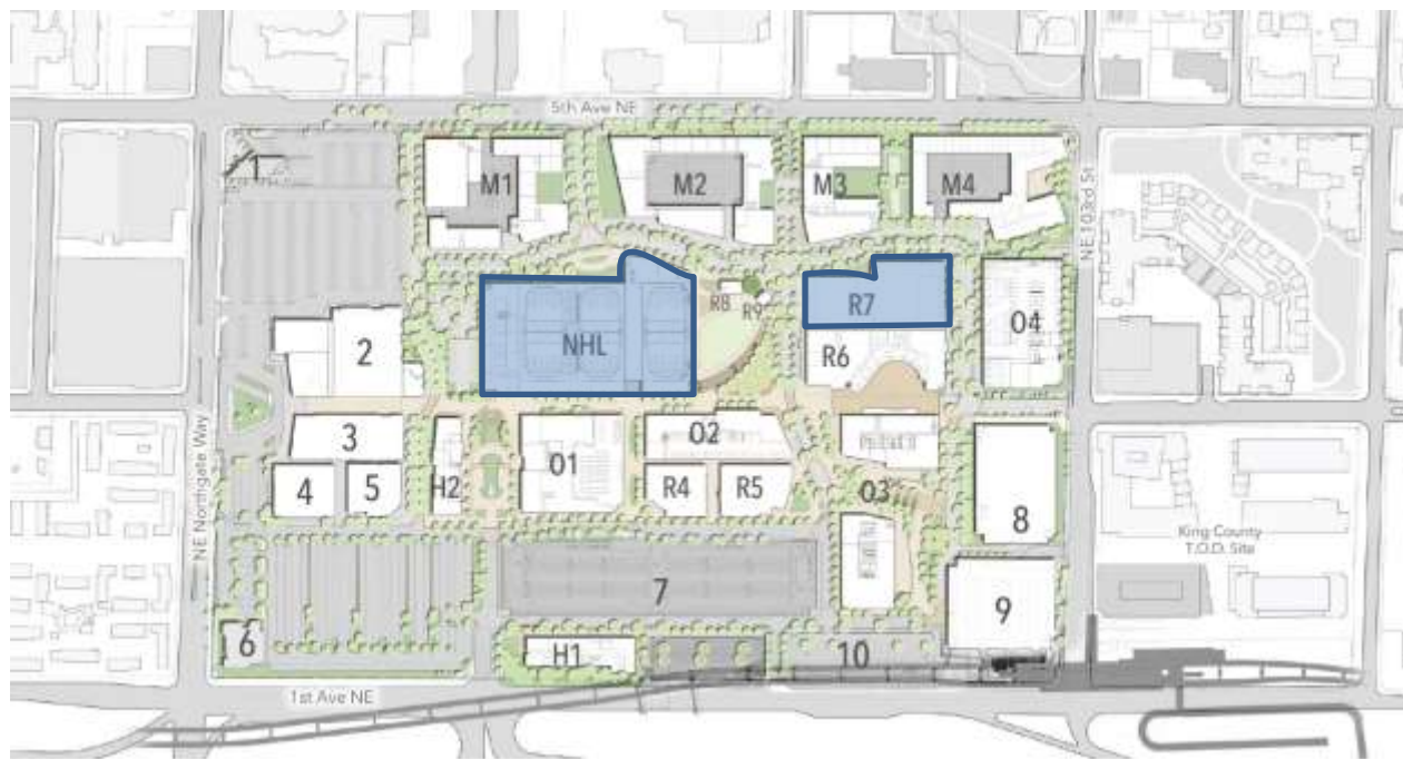
*Areas discussed in this meeting outlined in blue

The scope of the June 22, 2019 Design Recommendation meeting included the applicant presentation and Design Recommendation of the revised design for the NHL Ice Centre and the R7 Retail Building.