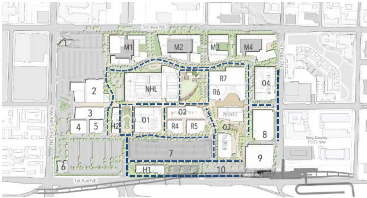
*Areas discussed in this meeting outlined in blue