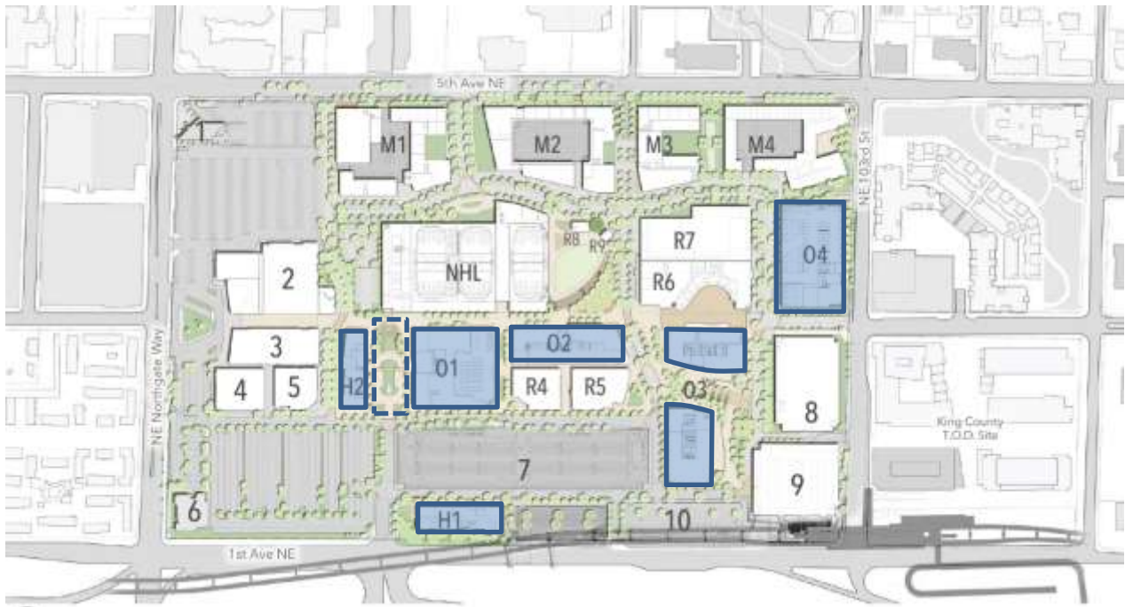
*Areas discussed in this meeting outlined in blue