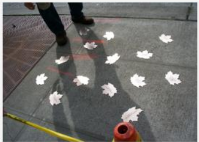
Leaves of Remembrance