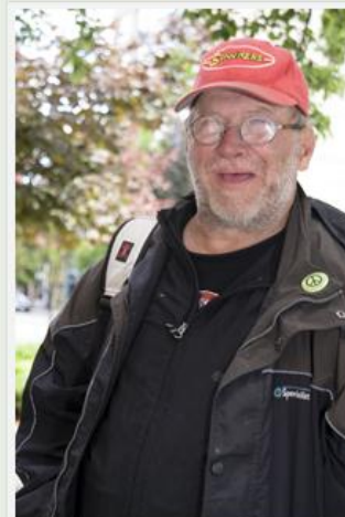
Real Change Vendor of the Week