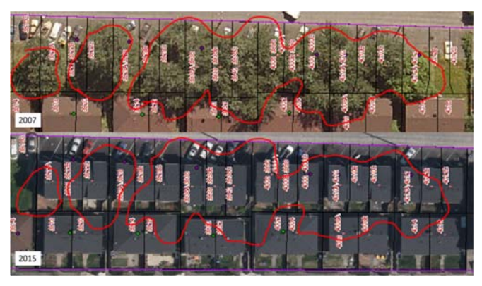
Before (2007) and after (2015) comparison

The objective of this assessment was to produce tree protection recommendations. The scope of the project was to look at effectiveness of existing regulations in Multifamily Low-rise and Single-family zones, as well as look at examples of tree protection regulations in regional cities and those similar in size to Seattle.