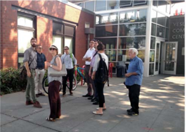
Commissioners on a tour of Yesler Terrace Redevelopment Project

The Commission and the Urban Forest Interdepartmental Team had their annual meeting at Camp Long. The facilitated meeting focused on strengthening the partnership between the Urban Forestry Commission and the Urban Forest Interdepartmental Team in order to accomplish the goals of the Urban Forest Stewardship Plan (UFSP), and working together to seed thoughts, set expectations, strategize, and build momentum for updating the UFSP. The group revisited best practices for urban forest management plans; had a discussion around the UFSP's key elements, structure, and goals; and identified and mapped UFSP stakeholders.