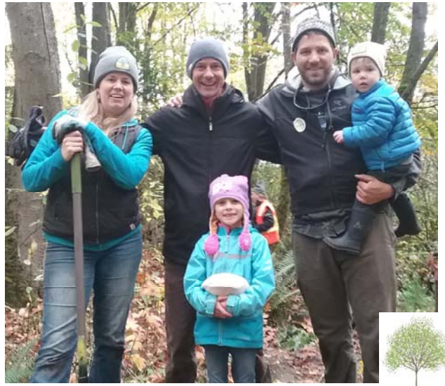
A group of Commissioners at Green Seattle Day

The UFC worked on building partnerships in 2017. The UFC engaged with Seattle Audubon. King County Million Trees Campaign, City Fruit, Urban Forestry Symposium, and the annual UFC/Interdepartmental Team working meeting. On November 4, seven Commissioners