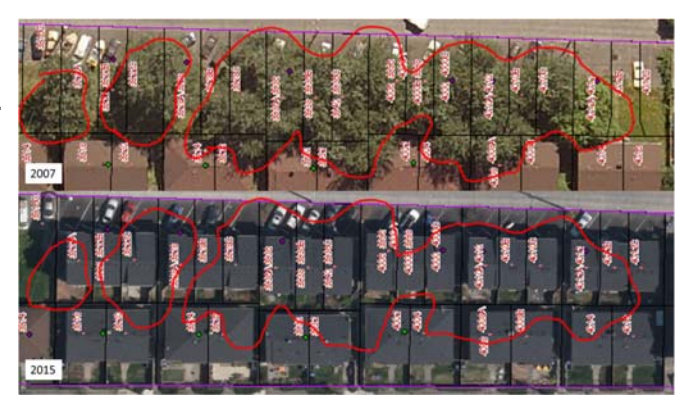
Before (2007) and after (2015) comparison

The objective of this assessment was to produce tree protection recommendations. The scope of the project was to look at effectiveness of existing regulations in Multifamily Low-rise and Single-family zones, as well as look at examples of tree protection regulations in regional cities and those similar in size to Seattle.