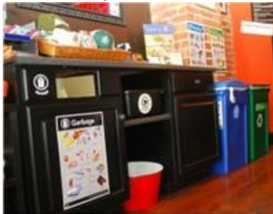
Cherry Street Coffee