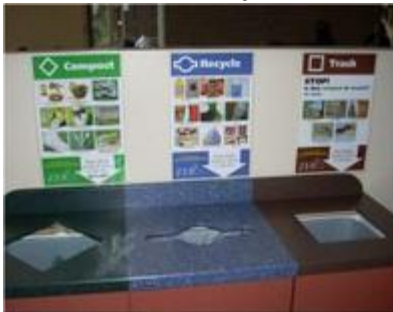
Seattle University Cafeteria