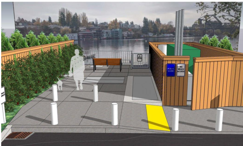
Design graphic and rendering are conceptual

We heard that the community would like a place to visit and enjoy views of Salmon Bay. As part of this project, we will provide a public amenity while also working to protect Seattle’s waterways and improve service reliability. The inclusion of a street-end public open space is also required by Seattle Municipal Code 23.60A.578.