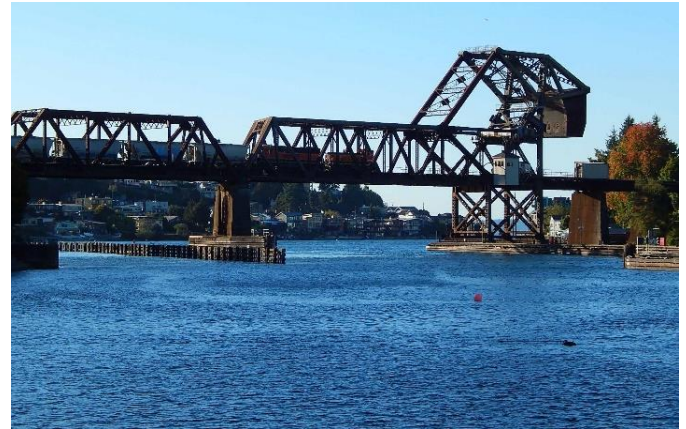
Photo of the Salmon Bay Bridge

Note, the construction schedule and duration are dependent on weather and other factors.