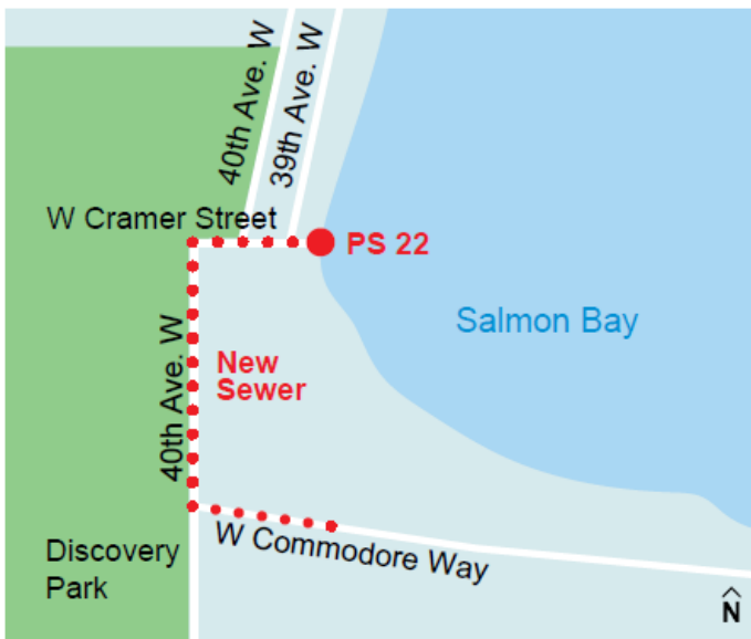
Map of project area

This project will upgrade an existing pump station and force main to reduce the occurrence of combined sewer overflows into Salmon Bay and improve service reliability for SPU customers.