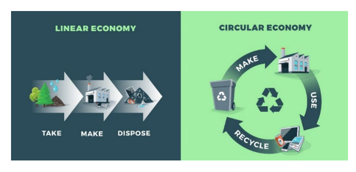
Linear compared to circular economy

In Seattle, glass recycling is an example of a local circular economy: Strategic Materials, Inc. 16 processes