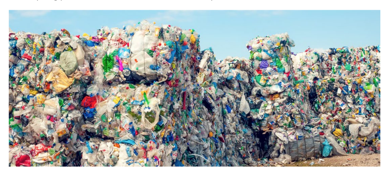
Bales of mixed plastics for recycling

While waste prevention is essential, recycling will remain part of Seattle's waste management system as an option to recover materials used to manufacture new products and reduce the need to extract raw materials to make new products. In the responsible recycling framework, participants in the solid waste system take responsibility for the waste and recyclables they generate so that the recyclables are sorted, processed, and, if necessary, disposed in a responsible manner. In addition, those who generate or collect recyclable materials—such as SPU and its customers—are held accountable for ensuring that the materials they recycle and the recycling process itself do not create harm locally or abroad.