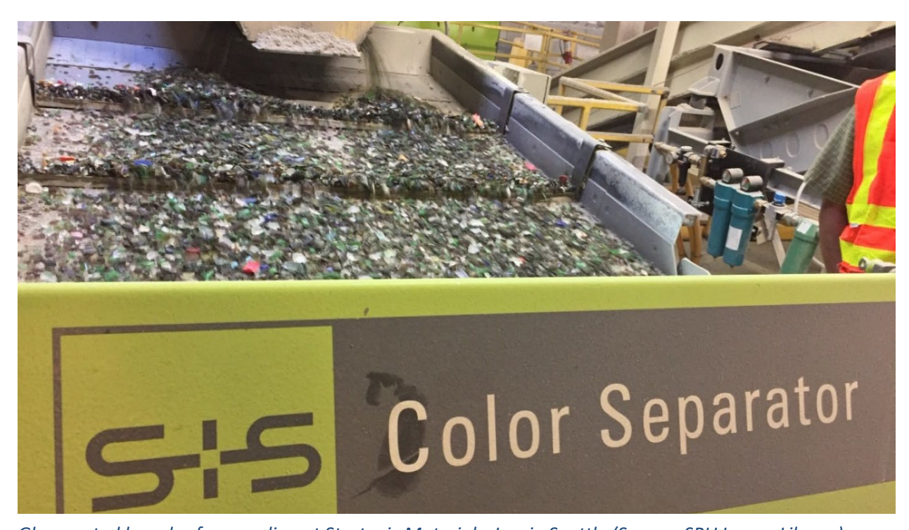
Glass sorted by color for recycling at Strategic Materials, Inc. in Seattle

glass from Seattle's curbside recycling stream and <u>Ardagh Group</u>, a global supplier of recyclable glass packaging, uses it to manufacture glass bottles.<sup>17</sup> SPU is working to identify and promote opportunities for similar circular material processing models at the local level.