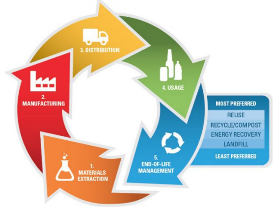
Materials Lifecycle Perspective Graphic