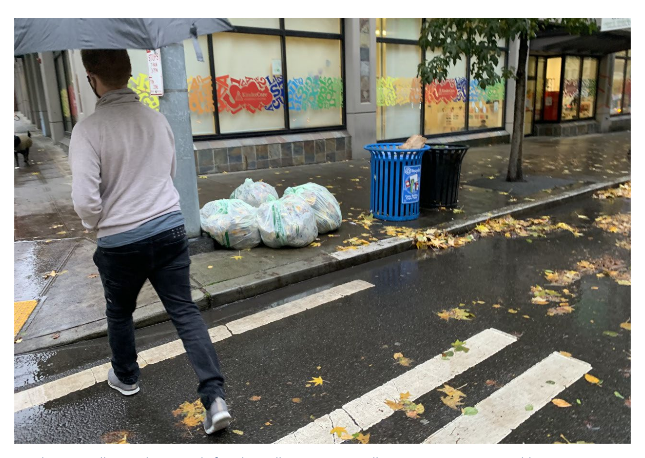
Food waste collection bags ready for Clear Alleys Program collection service next to public space waste containers